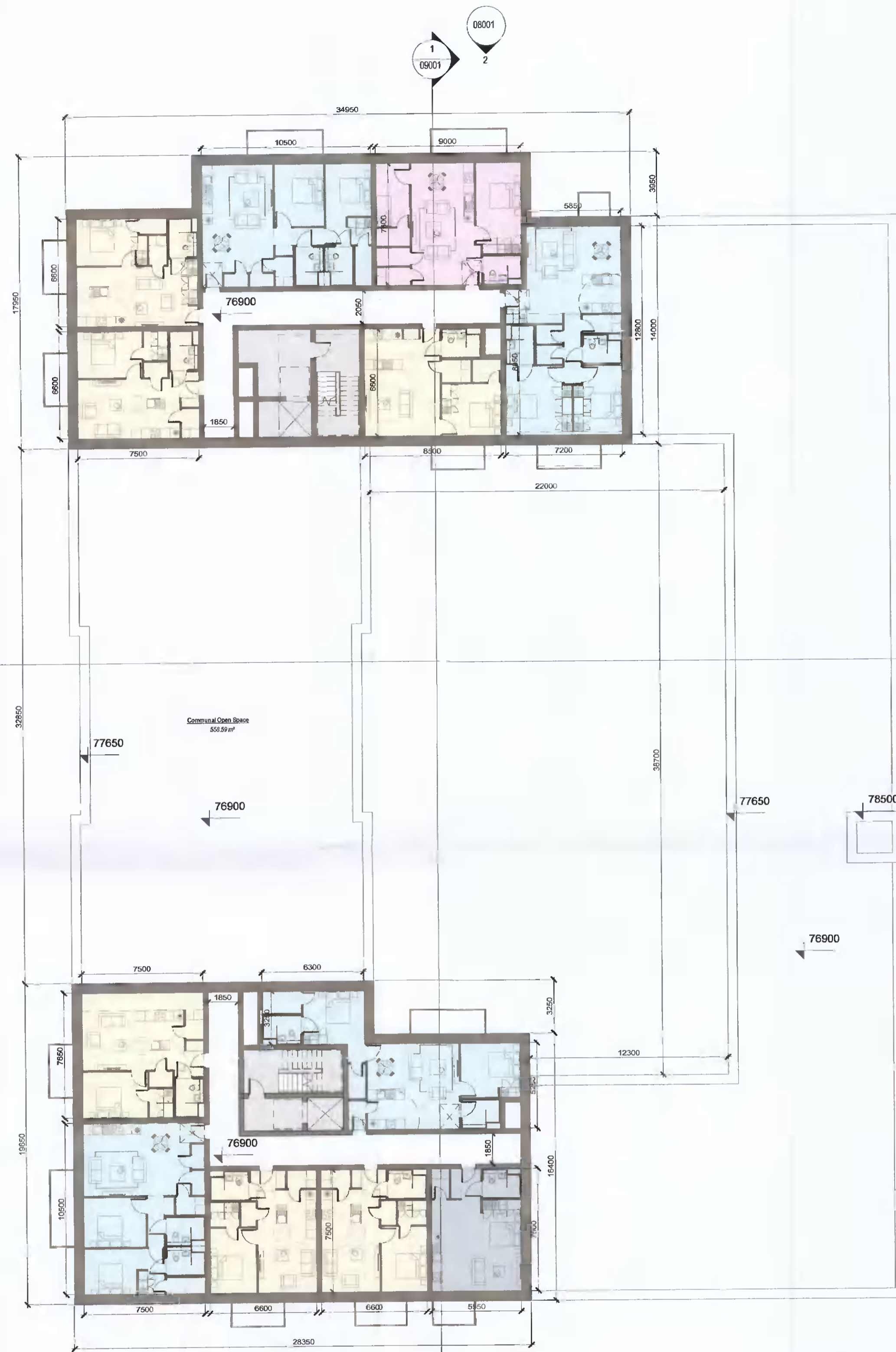
1 5th Floor Plan Scale: 1 : 200

12 Units Typical Floor 1 No Studio 6 No 1-bed 1 No 2-bed (3p) 4 No 2-bed (4p)