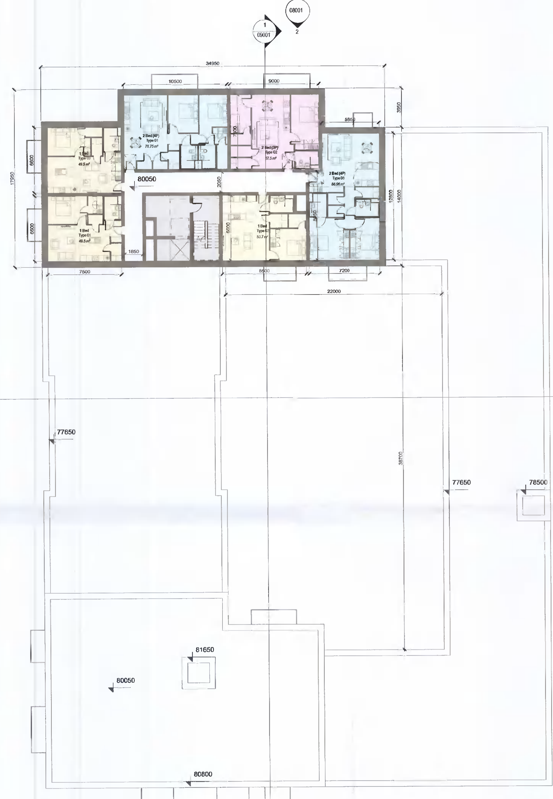
2 6th to 8th Floor Plan Scale: 1 : 200

12 Units Typical Floor 1 No Studio 6 No 1-bed 1 No 2-bed (3p) 4 No 2-bed (4p)