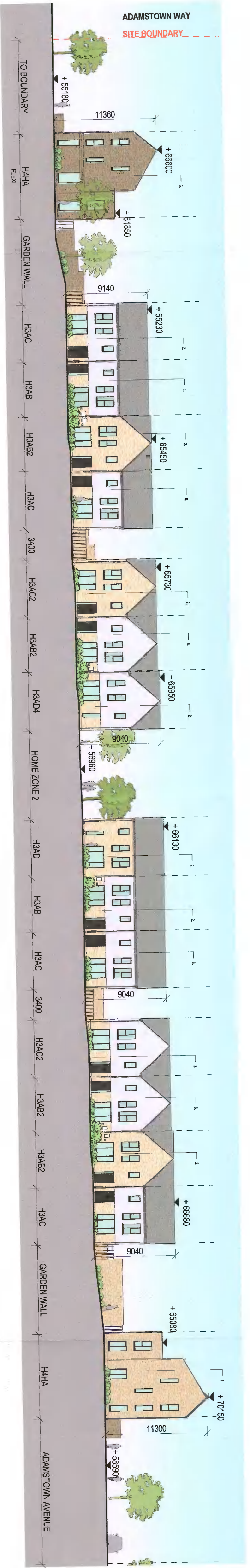
2 ZONE 1 CONTEXTUAL ELEVATION - SIDE STREET 02 Scale: 1:200