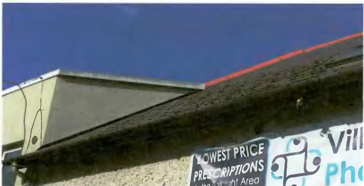
Extension at the rear of No.1 Main Street Tallaght, Dublin 24