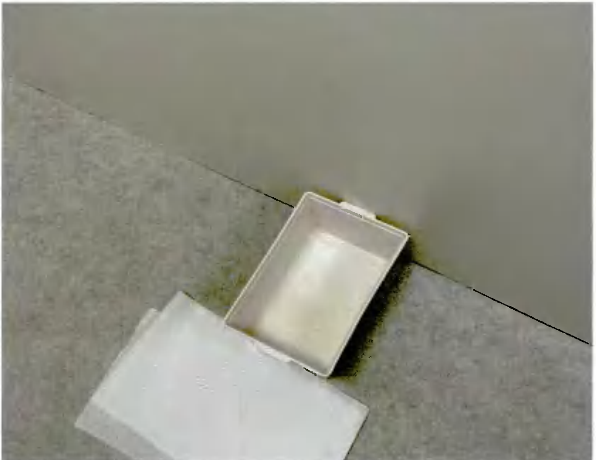
Dropping Water from leaking roof is collected during rain.