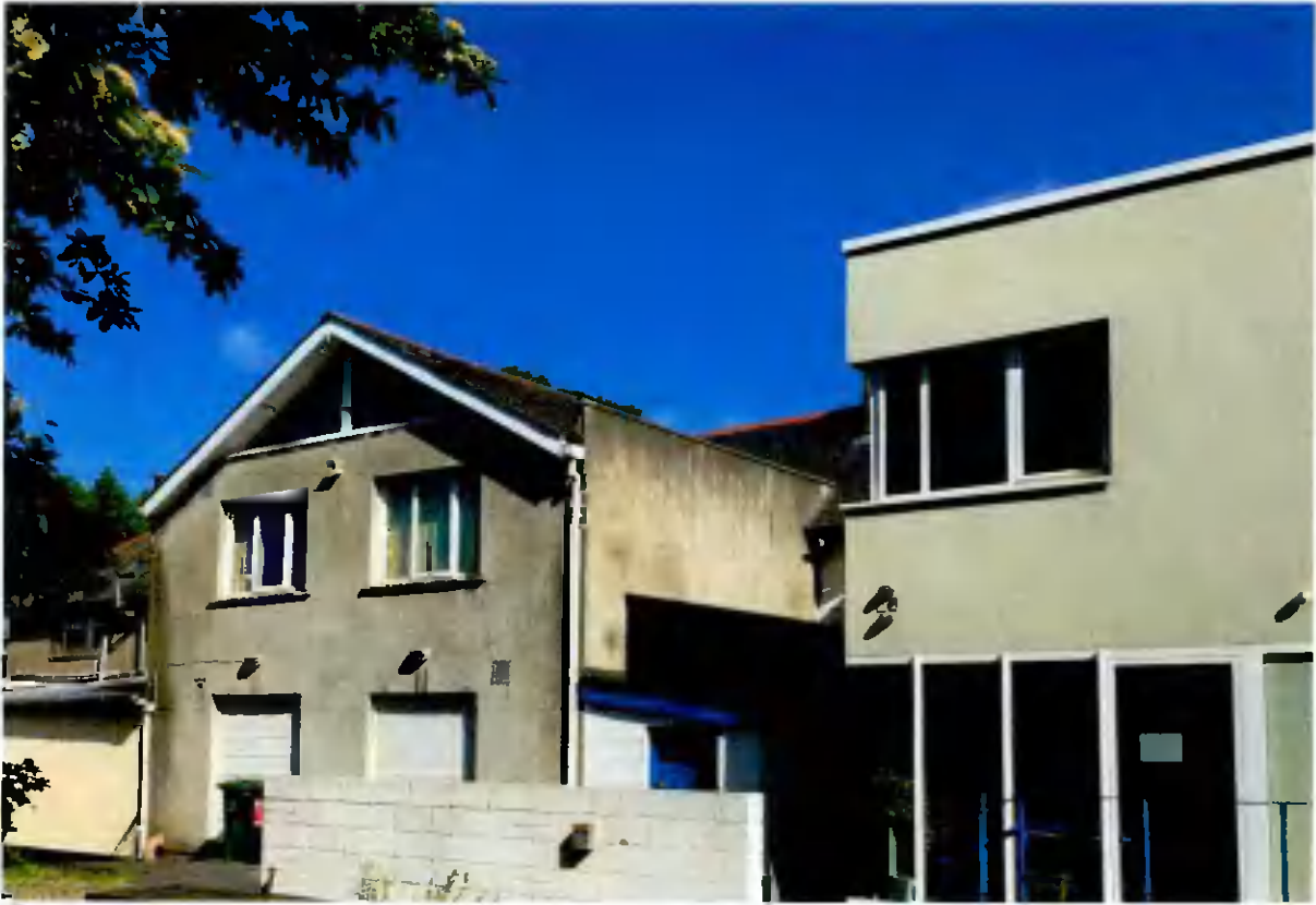
Extension at the rear of No. 3 Main Street Tallaght and uPVC windows are used.