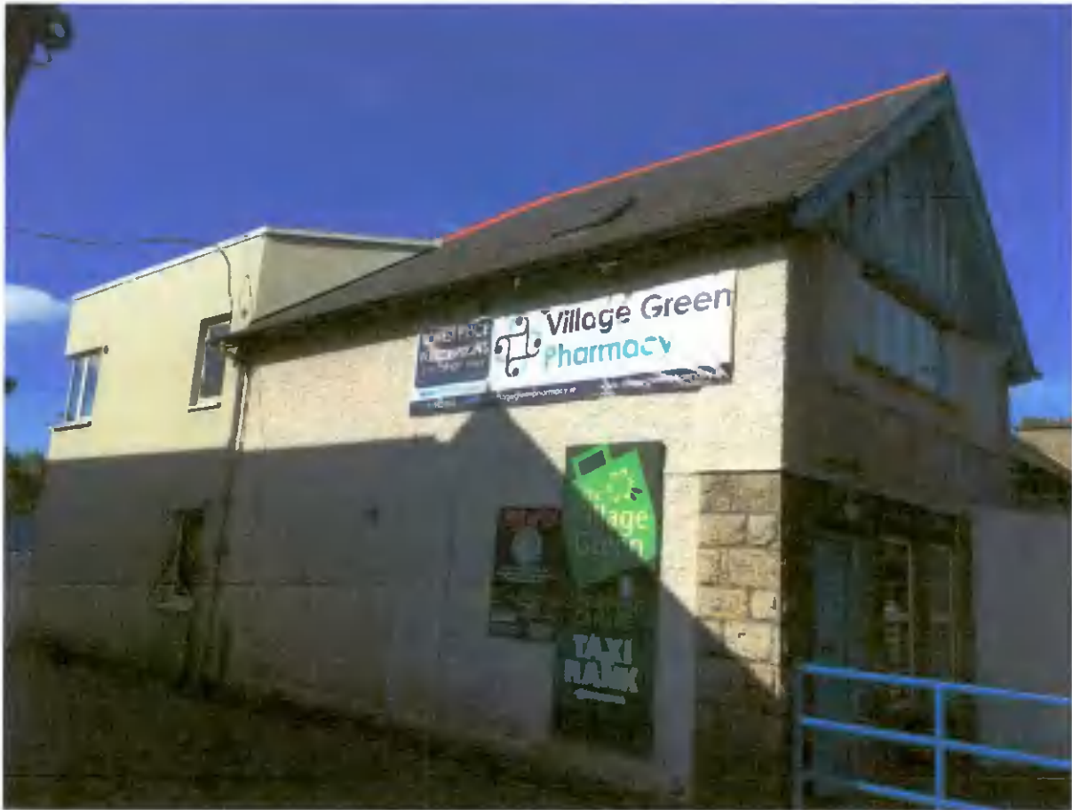
Extension at the rear of No. 1 Main Street Tallaght, Dublin 24

There are planning permissions granted to No. 1,2 Main Street Tallaght Dublin 24 and No. 3 Main Street Tallaght rear extensions which are building in the same Terraced/TJ Houses. Please see the pictures for their roof tiles and windows which are uPVC.