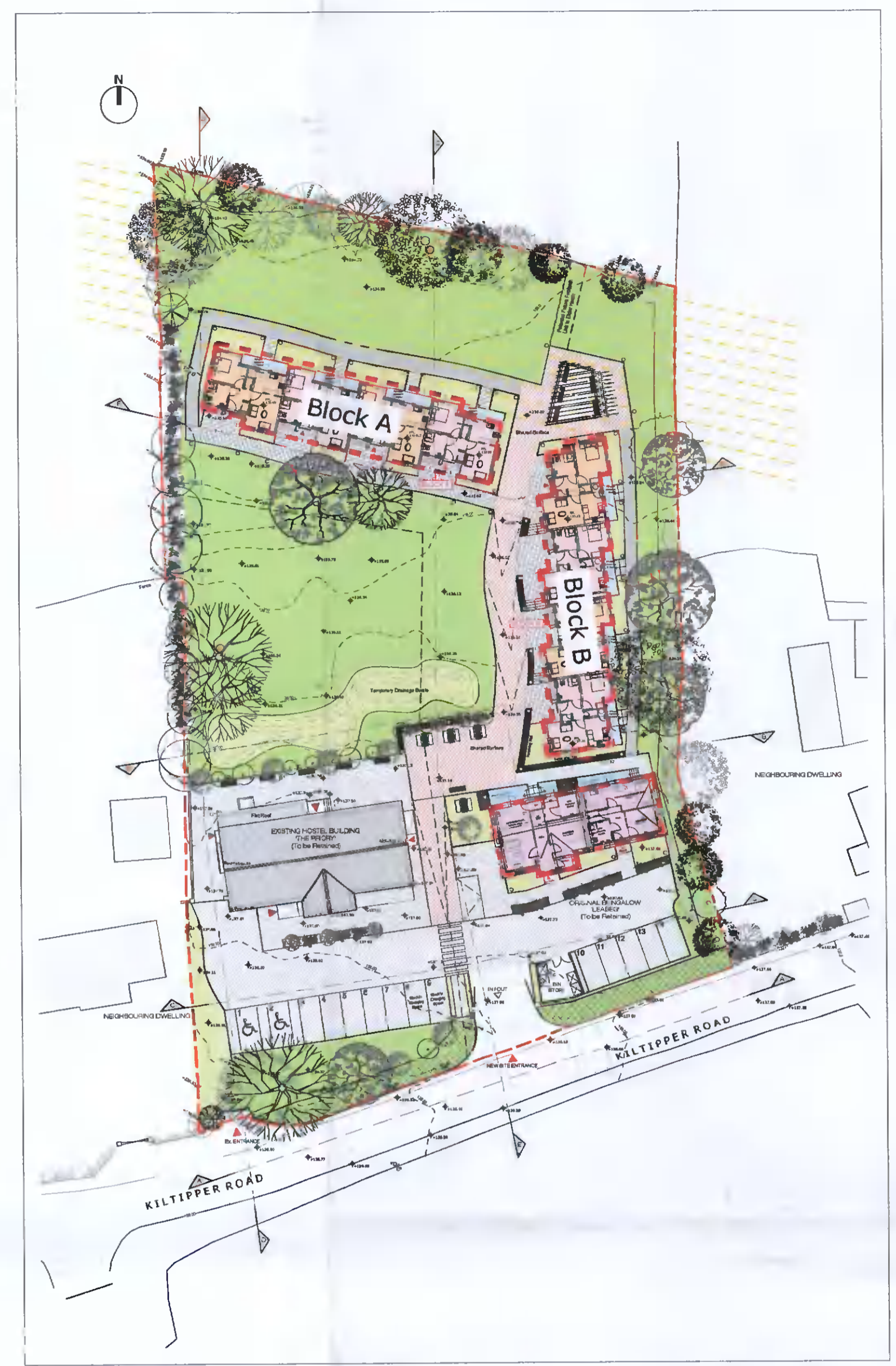
Proposed House Key Plan ■ scale 1:500 @ A1