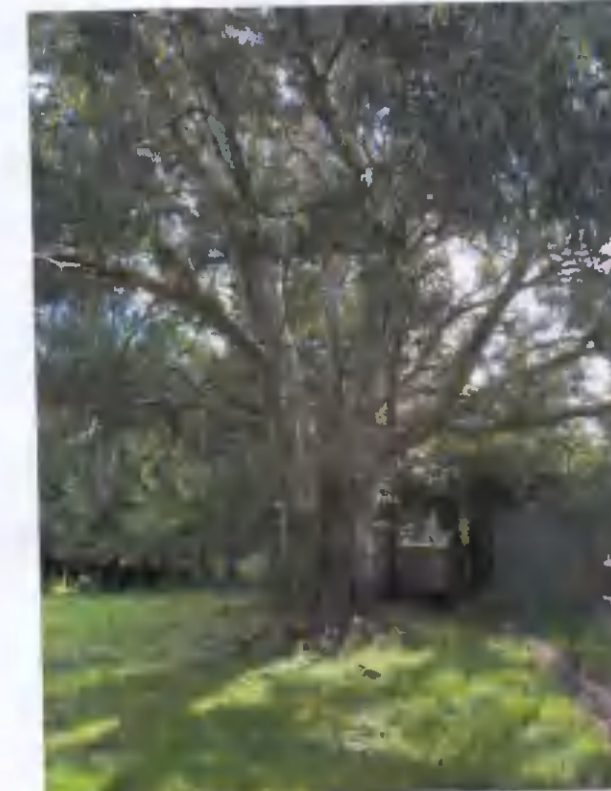
- Ex. Eucalyptus Tree to be Retained