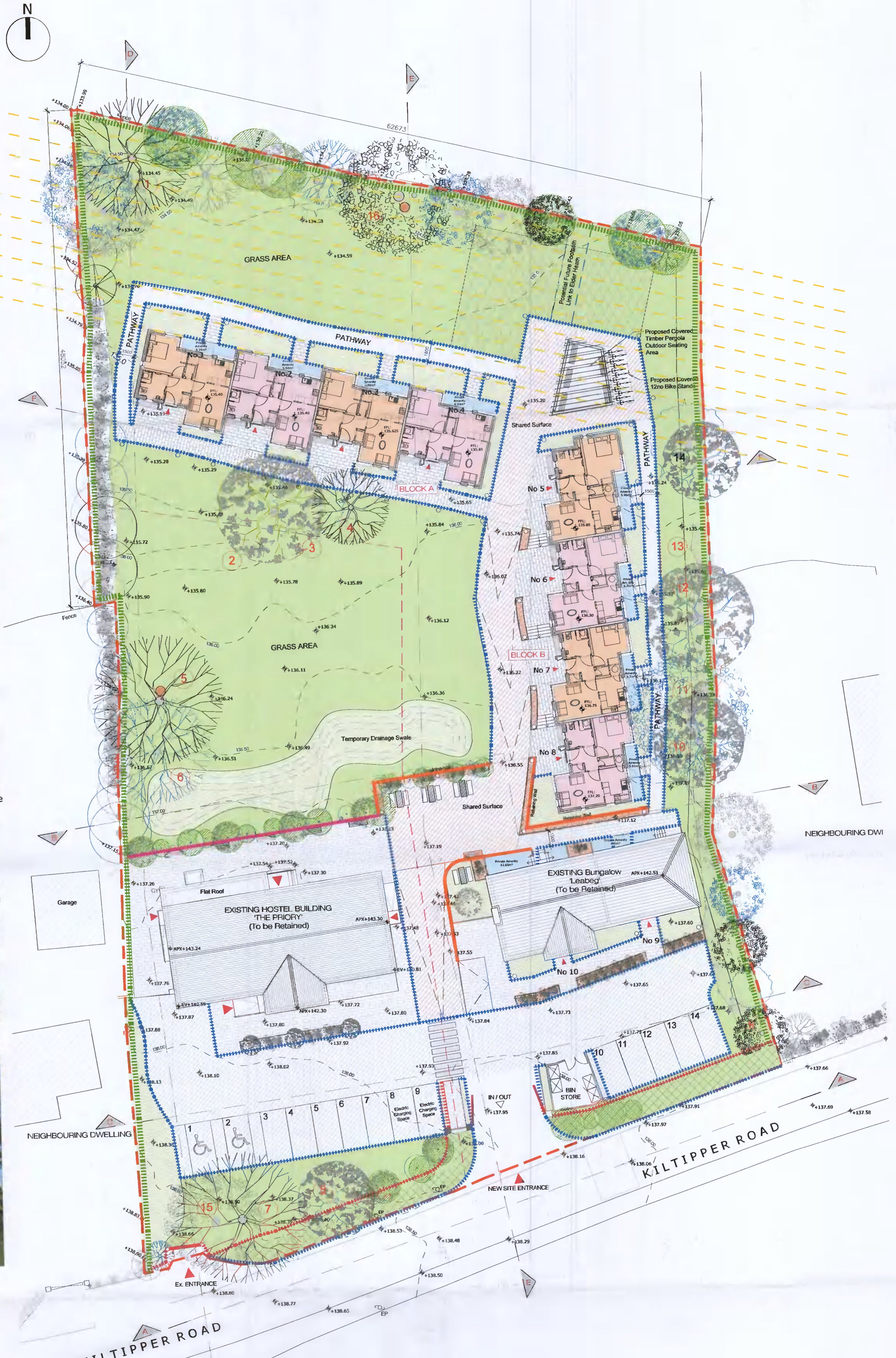
Landscape Layout Plan scale 1:200 @ A1