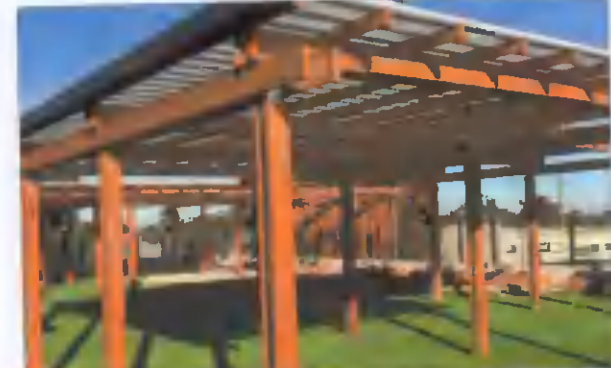
- Proposed Pergola Covered Spaces