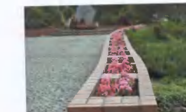
- Proposed Raised Bed Landscaping