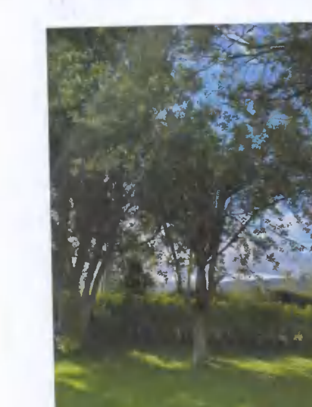
- Existing Hedgerows / Trees to be protected during construction