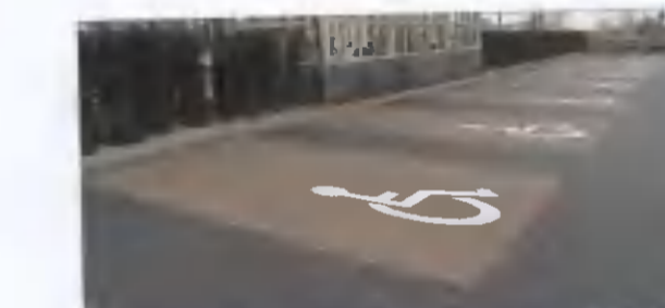
- Proposed Permeable Parking Surface