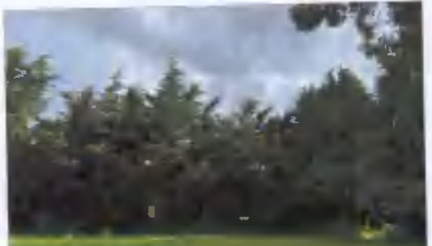
- Existing Hedgerows to be Retained