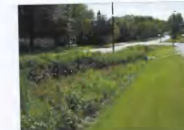
- Proposed Landscaped Drainage Swale