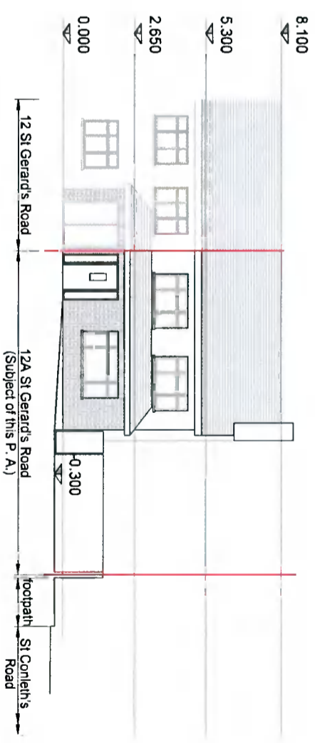
Contiguous Proposed Front Elevation (no change) SCALE 1:200