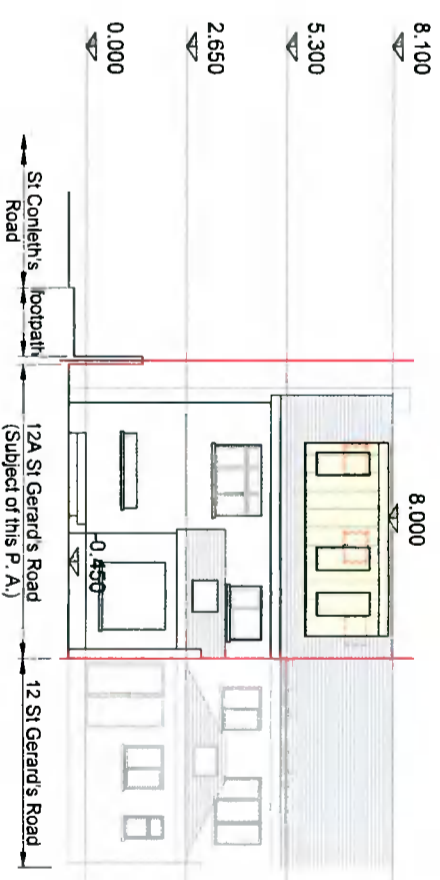
Contiguous Proposed Rear Elevation SCALE 1:200