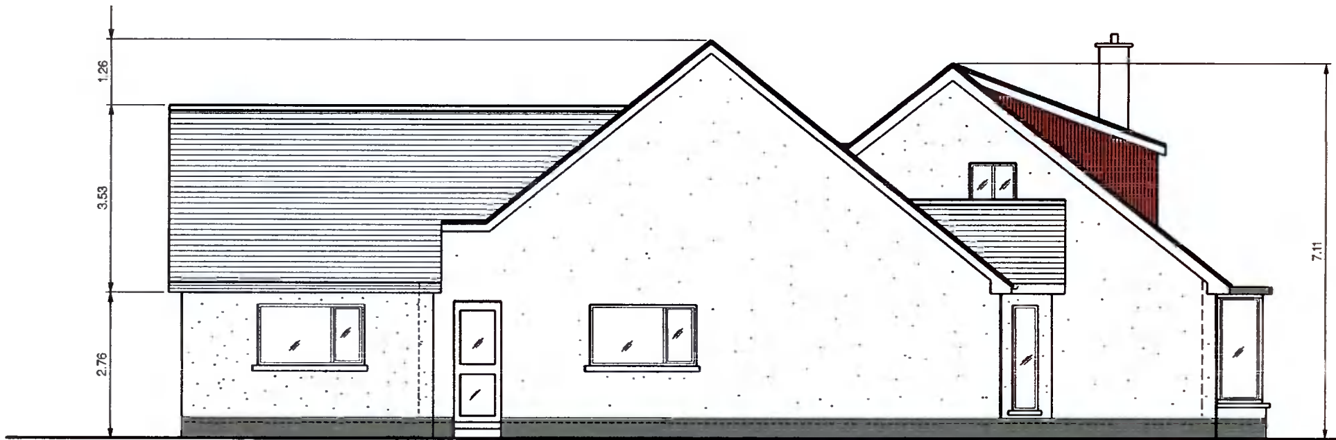
PROPOSED END ELEVATION (NO CHANGE)