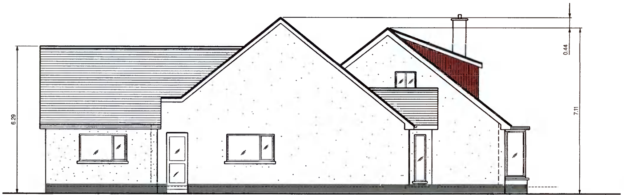
EXISTING END ELEVATION