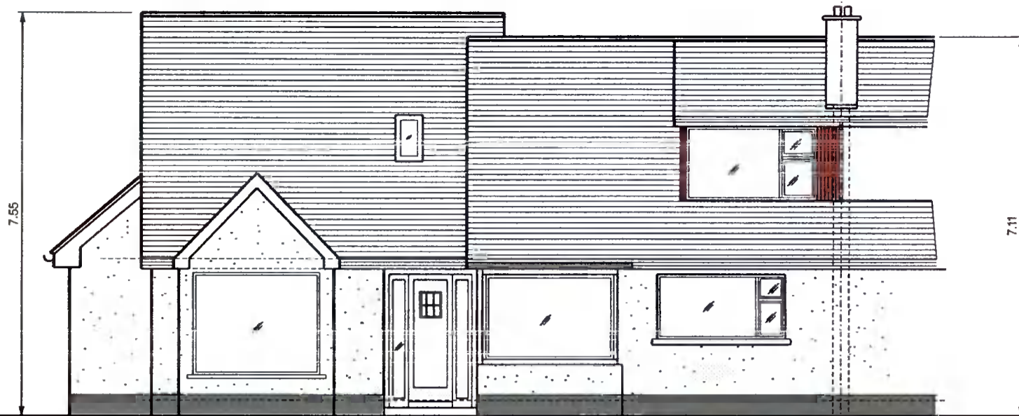
PROPOSED FRONT ELEVATION (NO CHANGE)