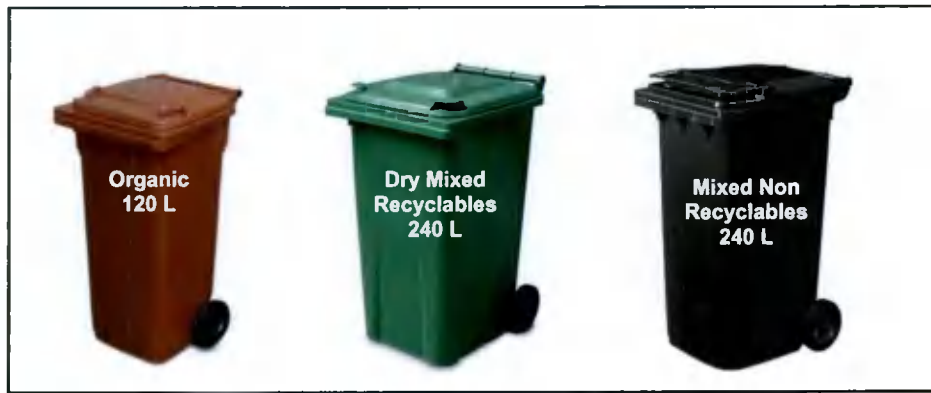
Figure 5.1 Typical waste receptacles of varying size (120 L and 240 L)