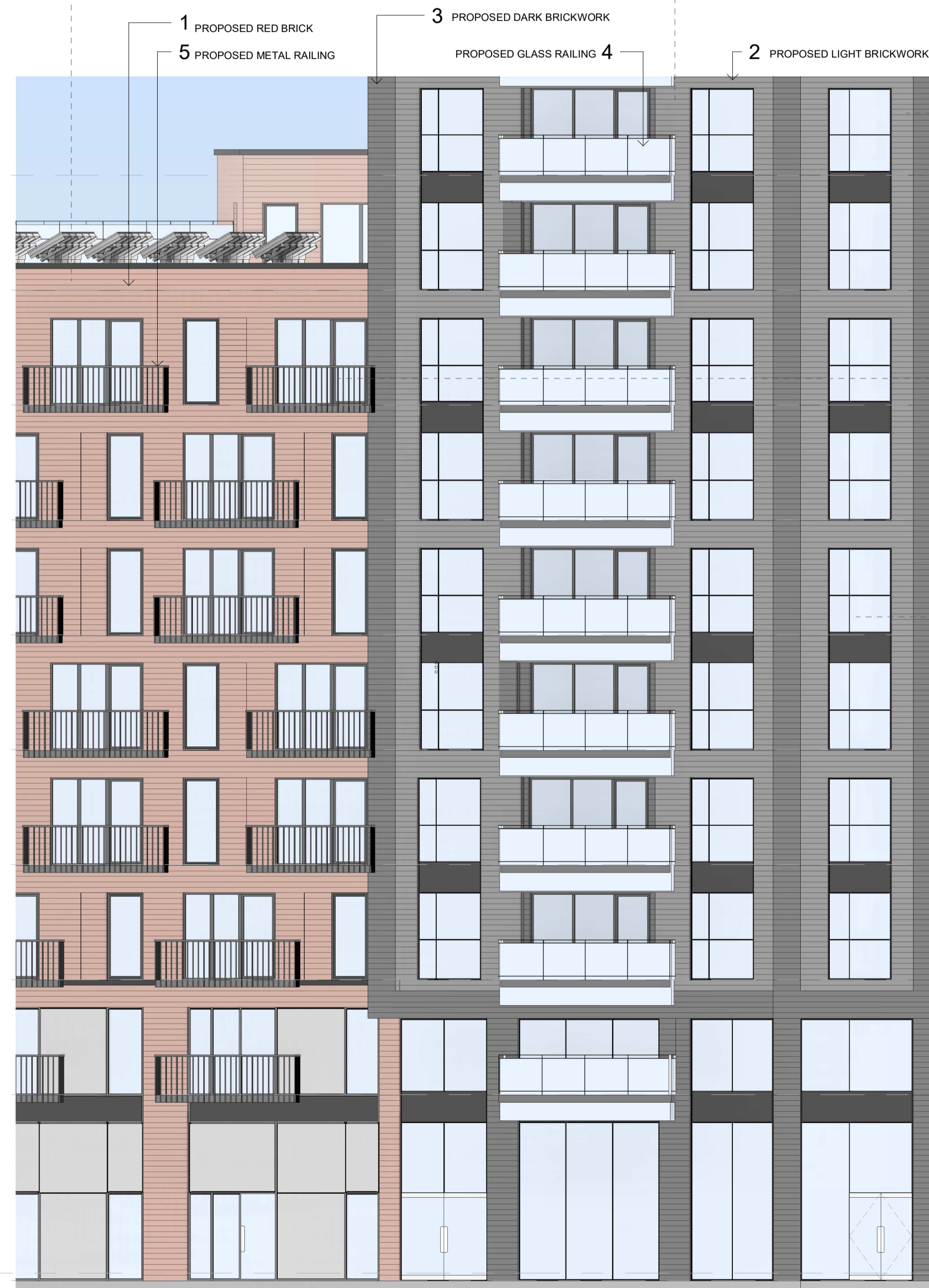
1 Material Elevation 1