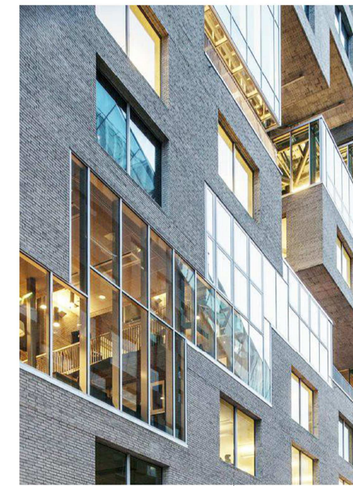
6 PROPOSED WINDOWS