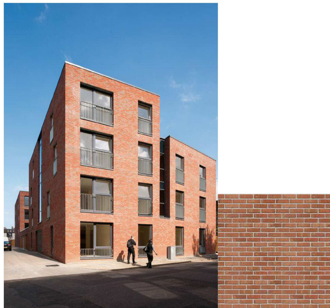
1 PROPOSED RED BRICKWORK FACADE