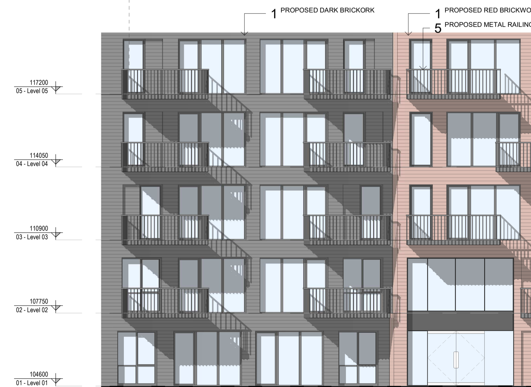
2 Material Elevation 2