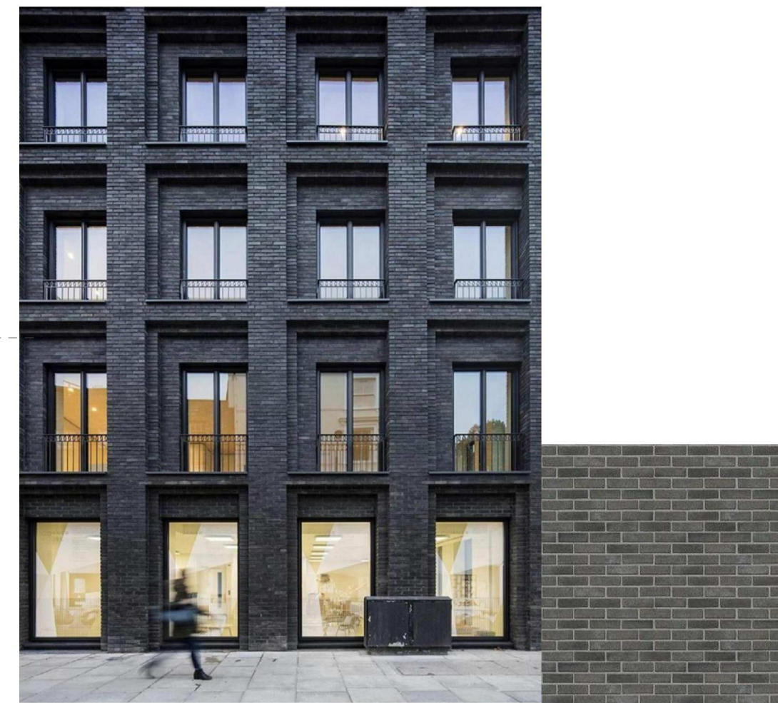
3 PROPOSED DARK BRICKWORK FACADE