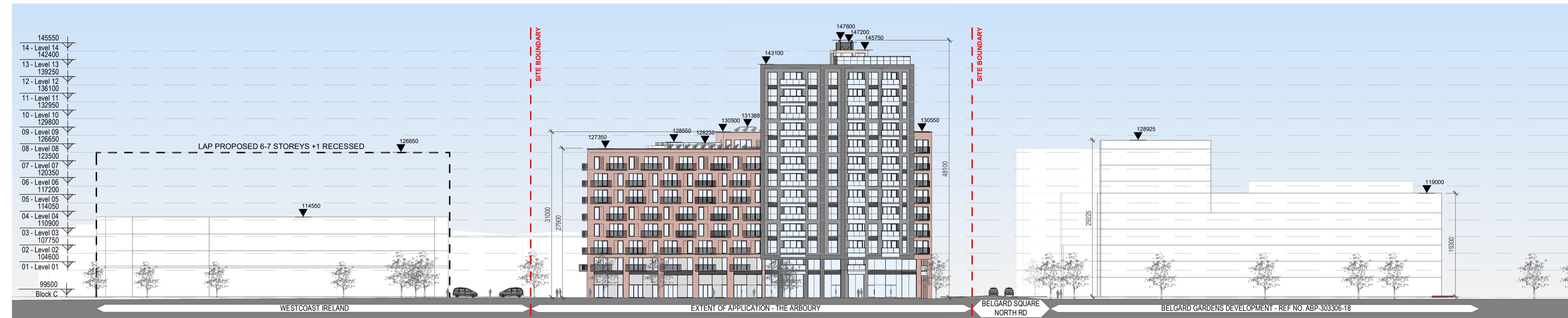
2 Elevation Contextual - East