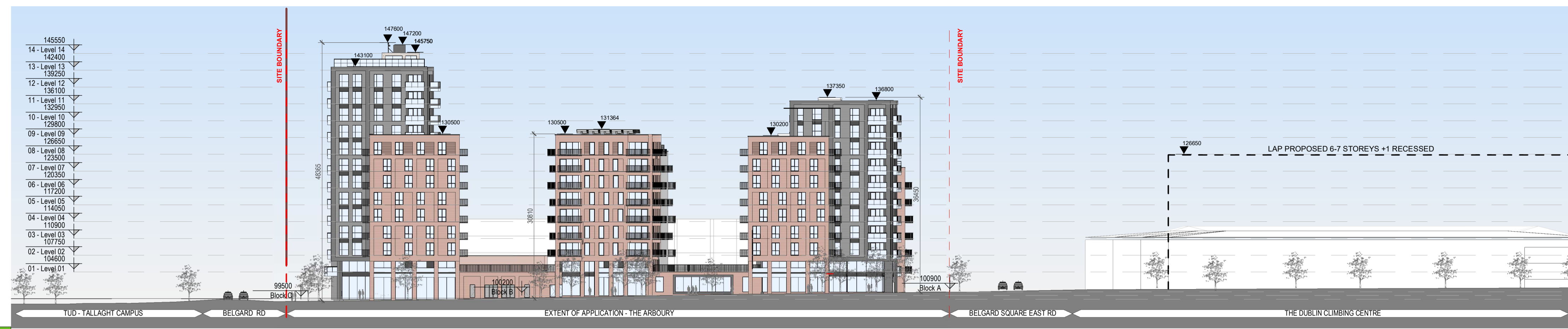
1 Elevation Contextual - North