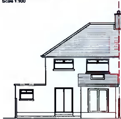
SURVEY REAR ELEVATION Scale 1:100