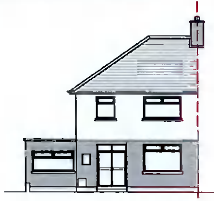
SURVEY FRONT ELEVATION Scale 1:100