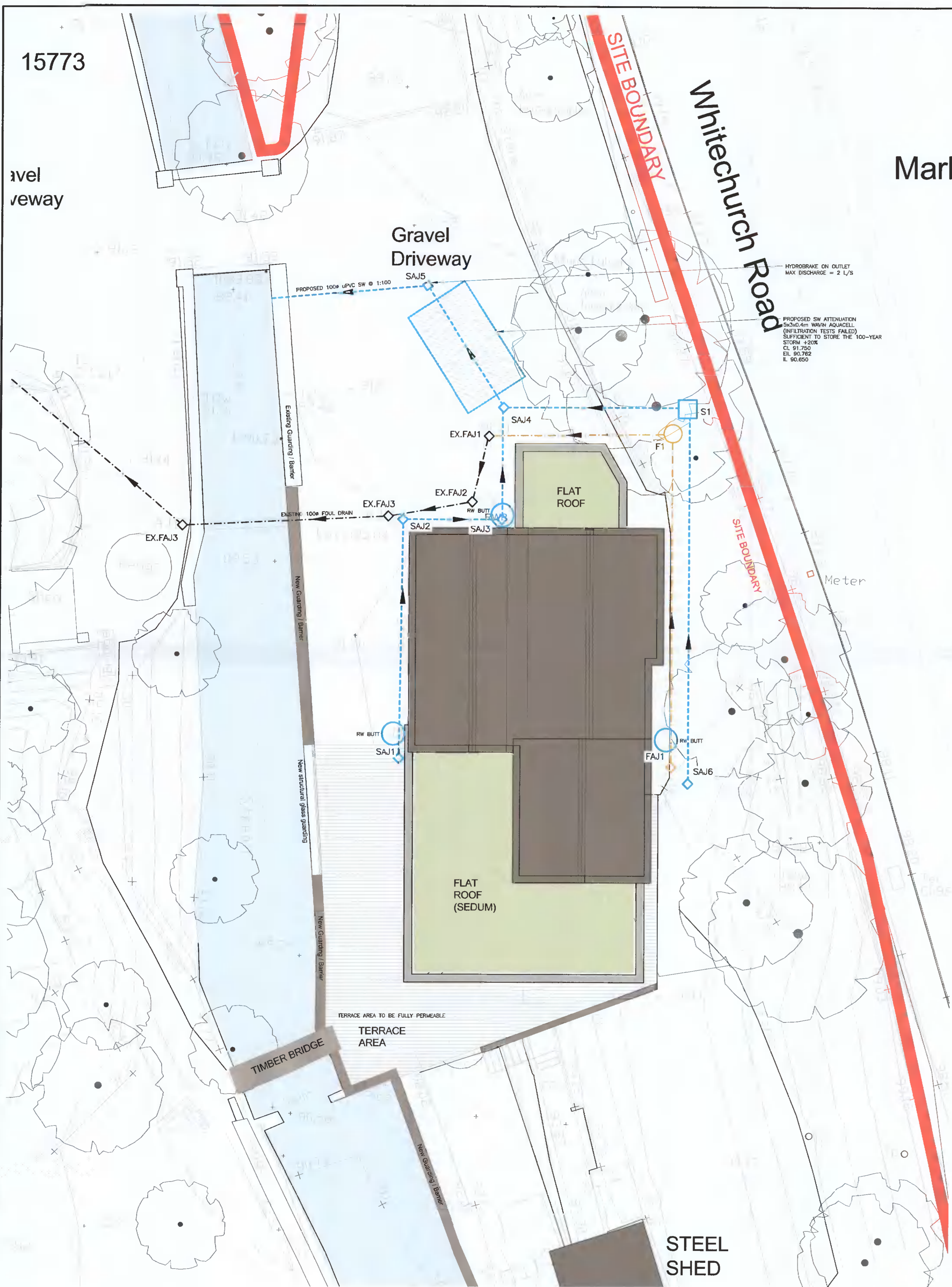
SITE LAYOUT PLAN - DRAINAGE