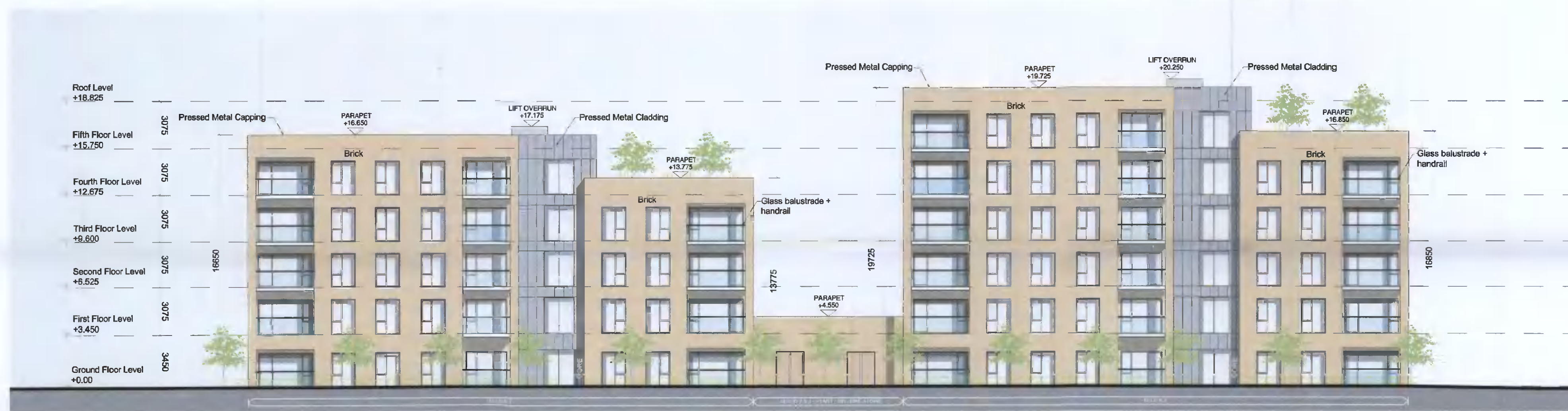
02- WEST ELEVATION