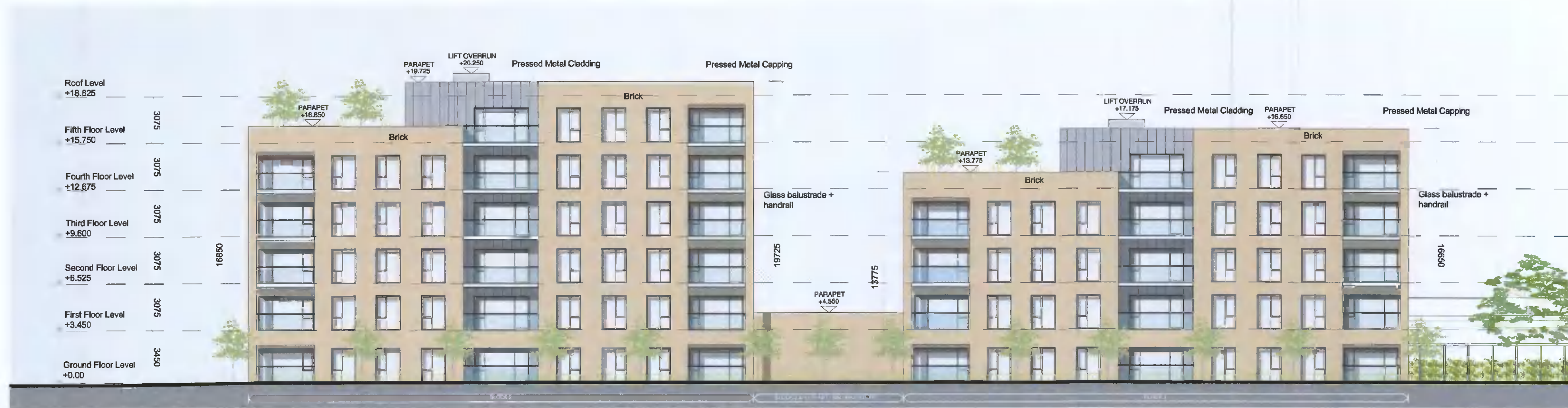
01 - EAST ELEVATION

Render removed from material palette as per ABP conditions