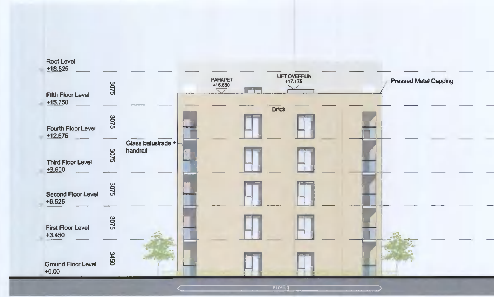
04- NORTH ELEVATION