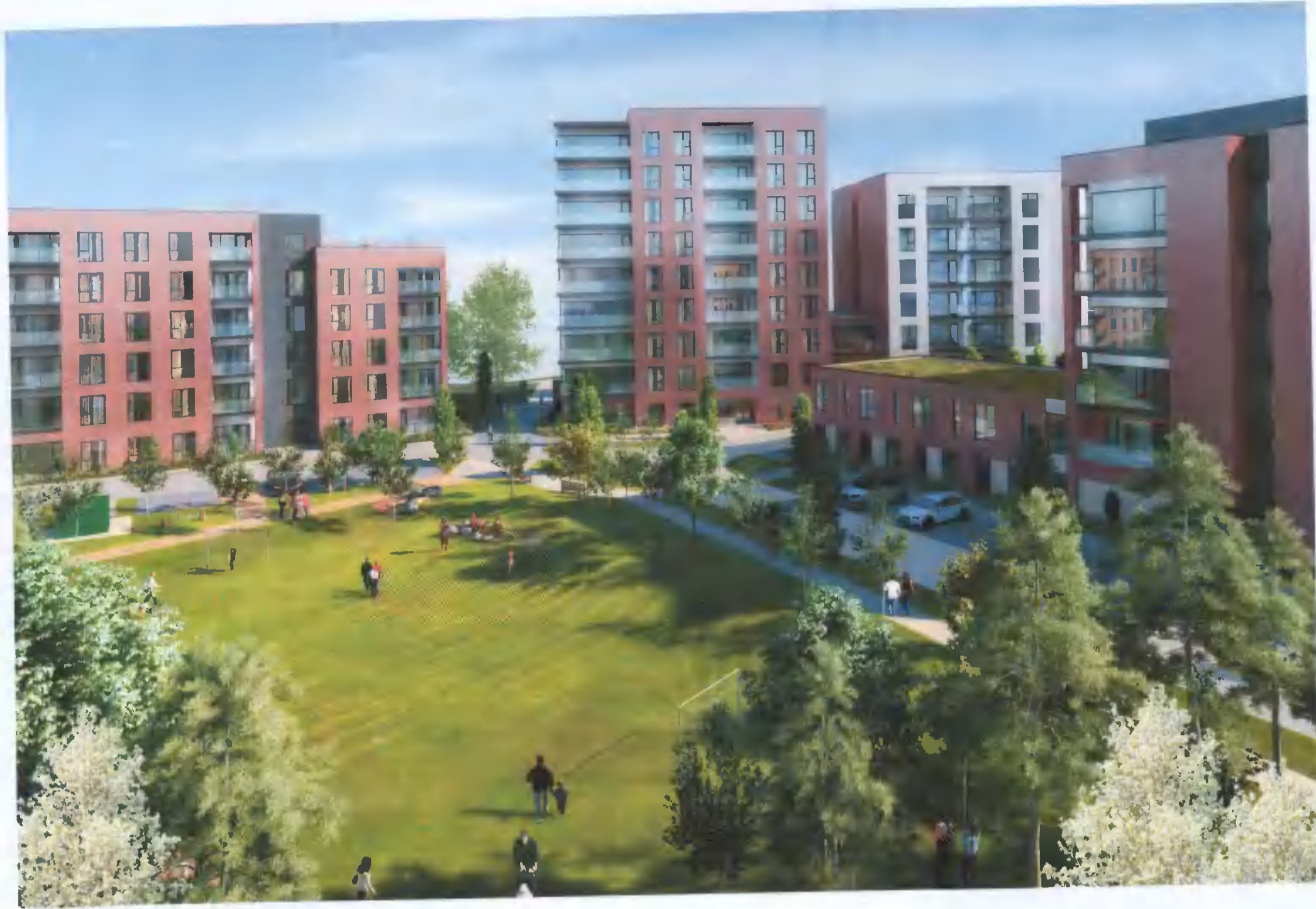
VIEW 1 OVERLOOKING THE PUBLIC OPEN SPACE