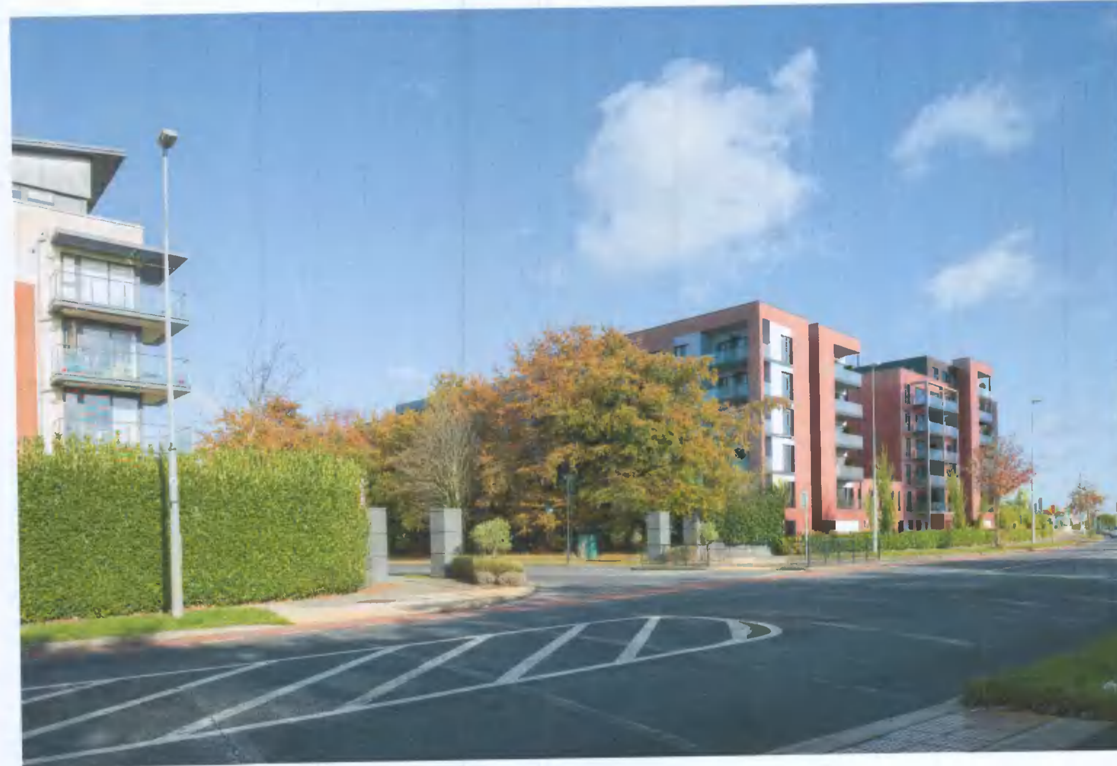
VIEW 2 VIEW OF BLOCK 1 AT ENTRANCE FROM ST. LOMANS ROAD