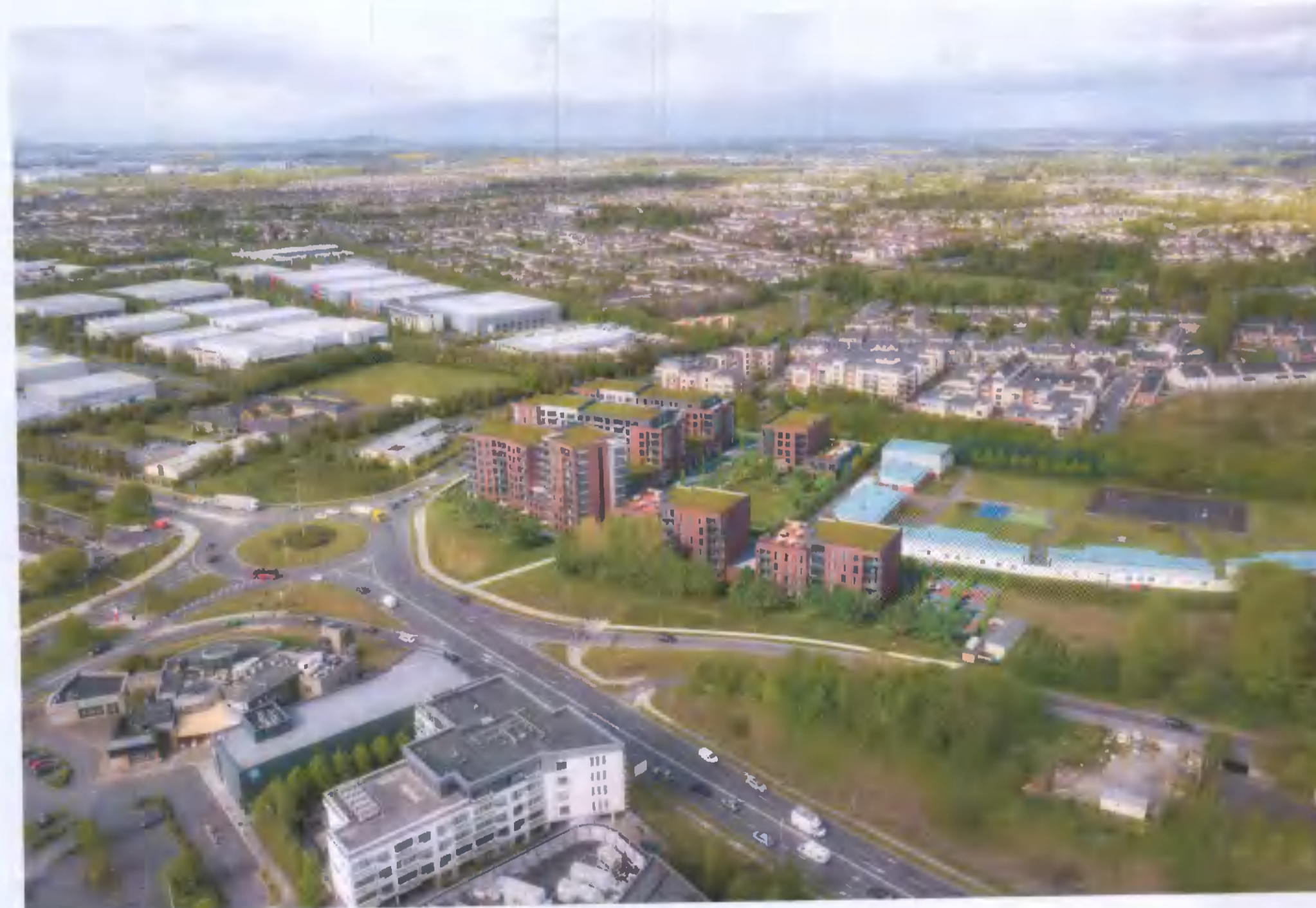
VIEW 4 AERIAL VIEW OF DEVELOPMENT