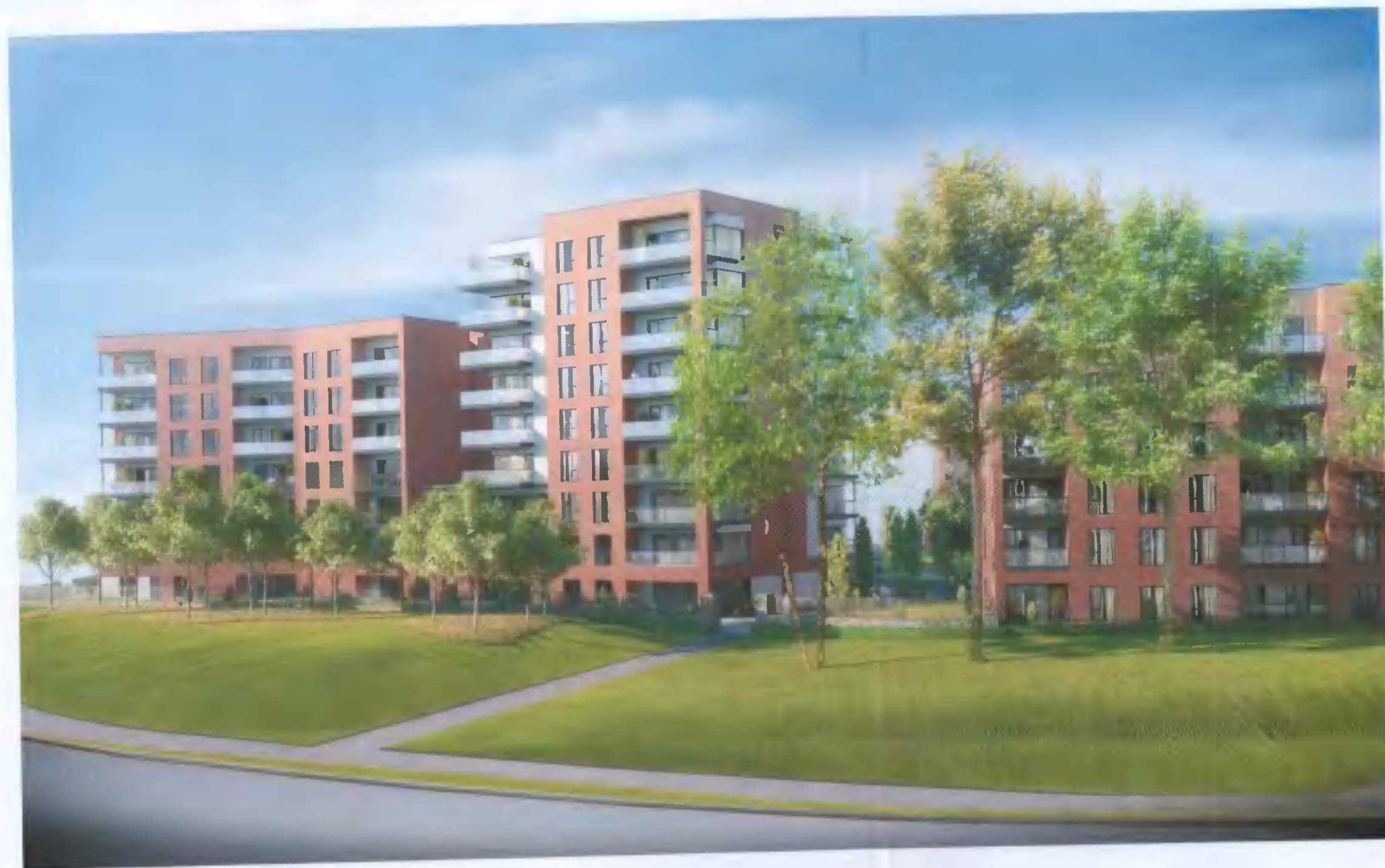
VIEW 3 VIEW FROM THE N4 SLIPWAY

Balconies: Painted steel construction with glazed balustrading facing external public areas. Painted steel vertical bar balustrade detail to balconies on internal courtyard side of building.