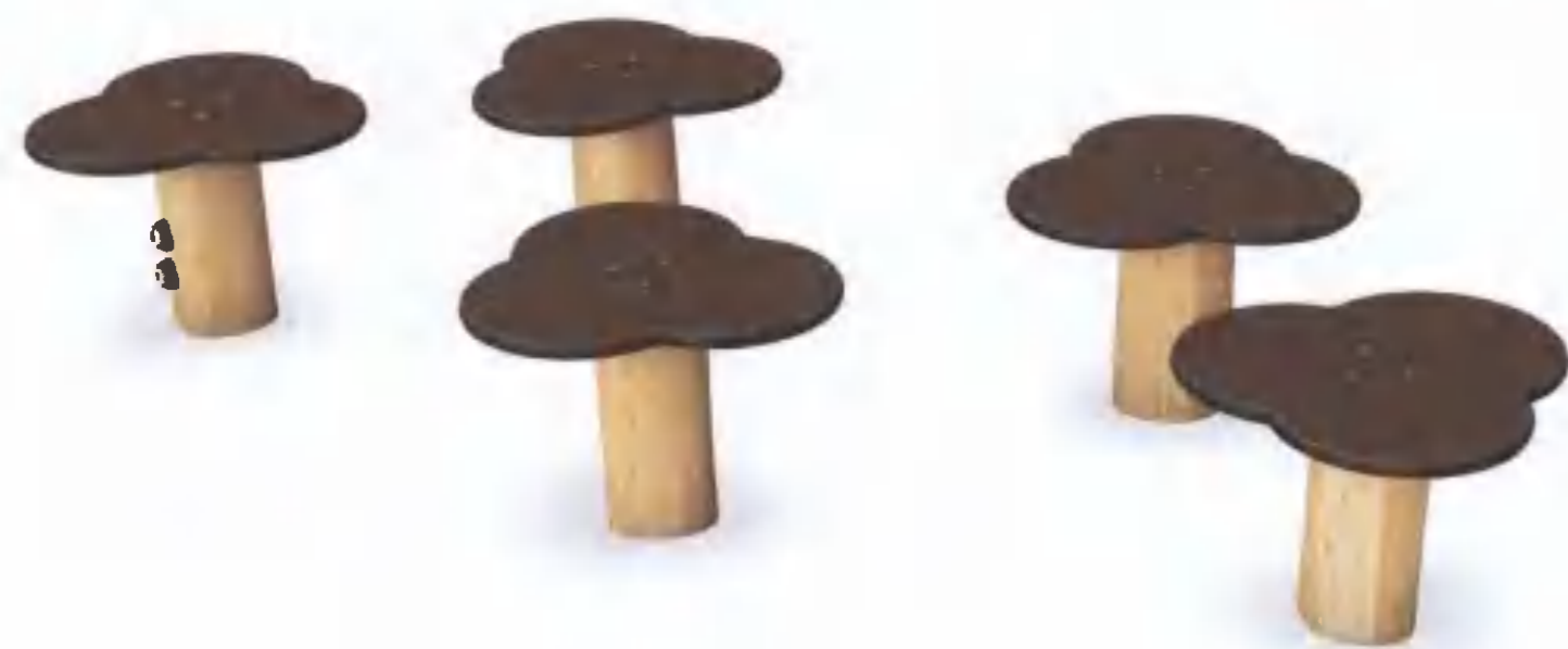
01 WATERLILIES BALANCE POST REFERENCE IMAGE N/A