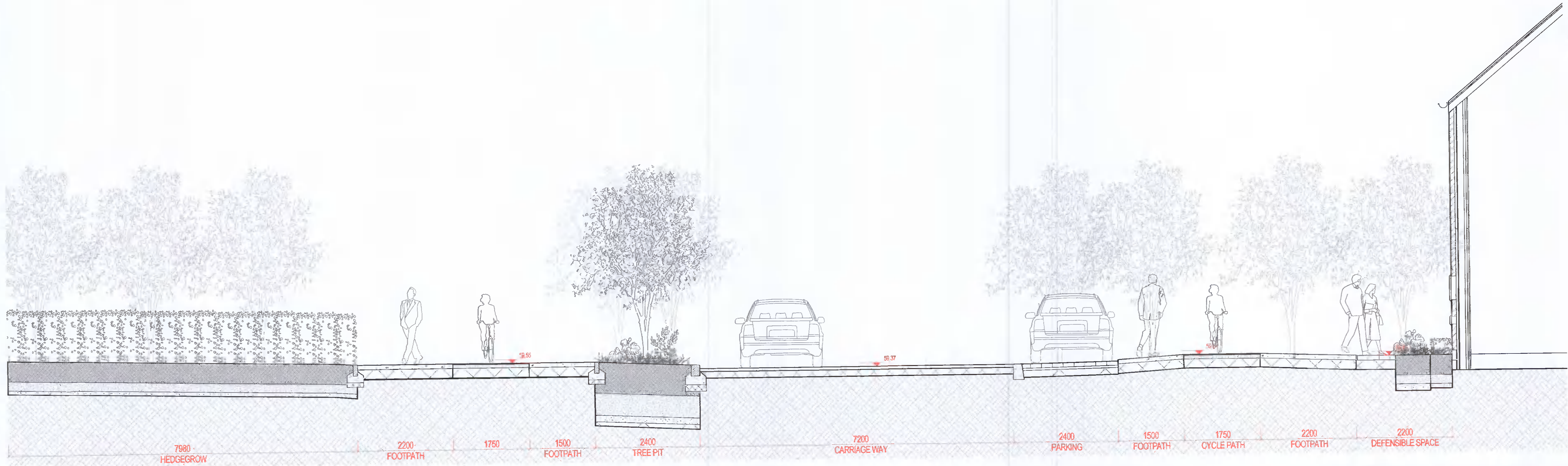
03 Section 03 1:50 @A1