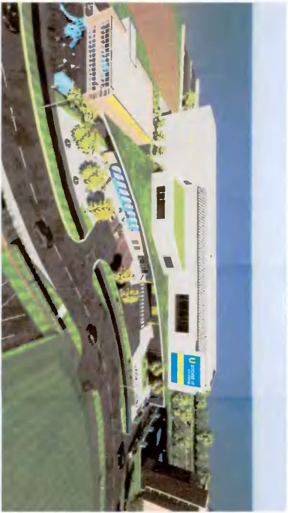
Aerial View 1