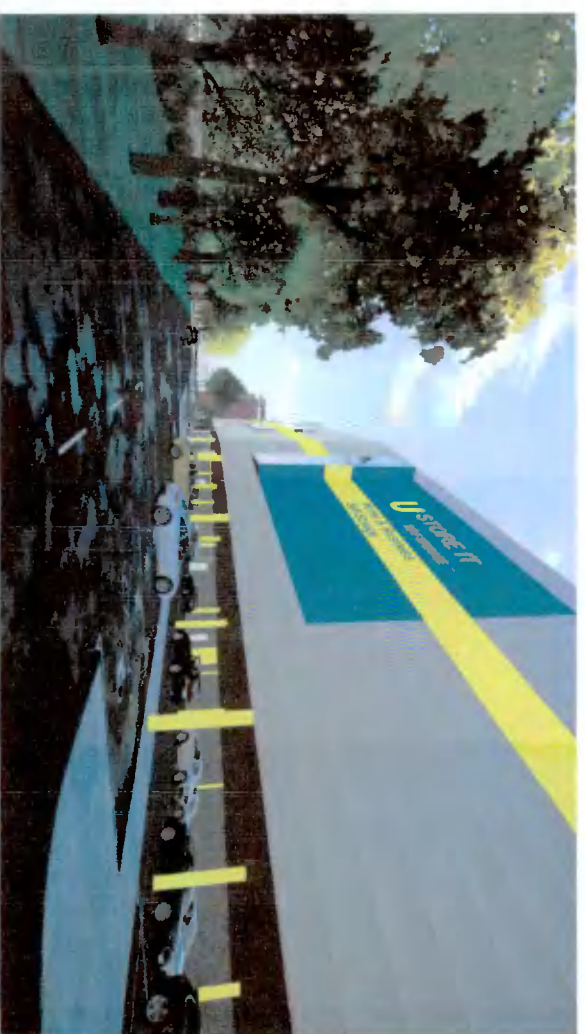
Basement Car Park Facing East