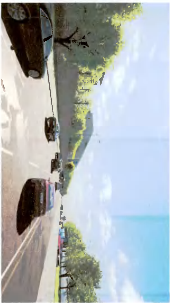
N4 Facing West