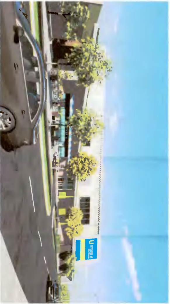
View Facing North