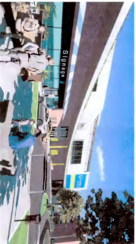
View Facing North-East