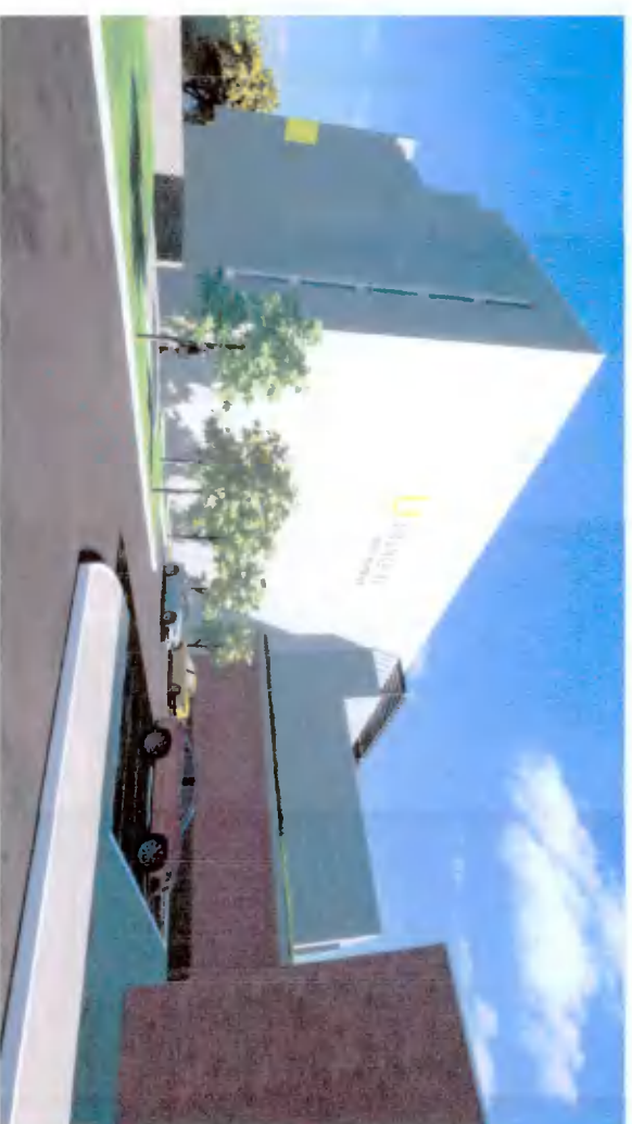
View Facing North-East