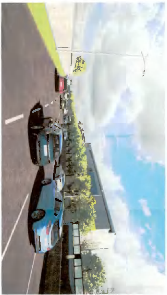
N4 Facing East