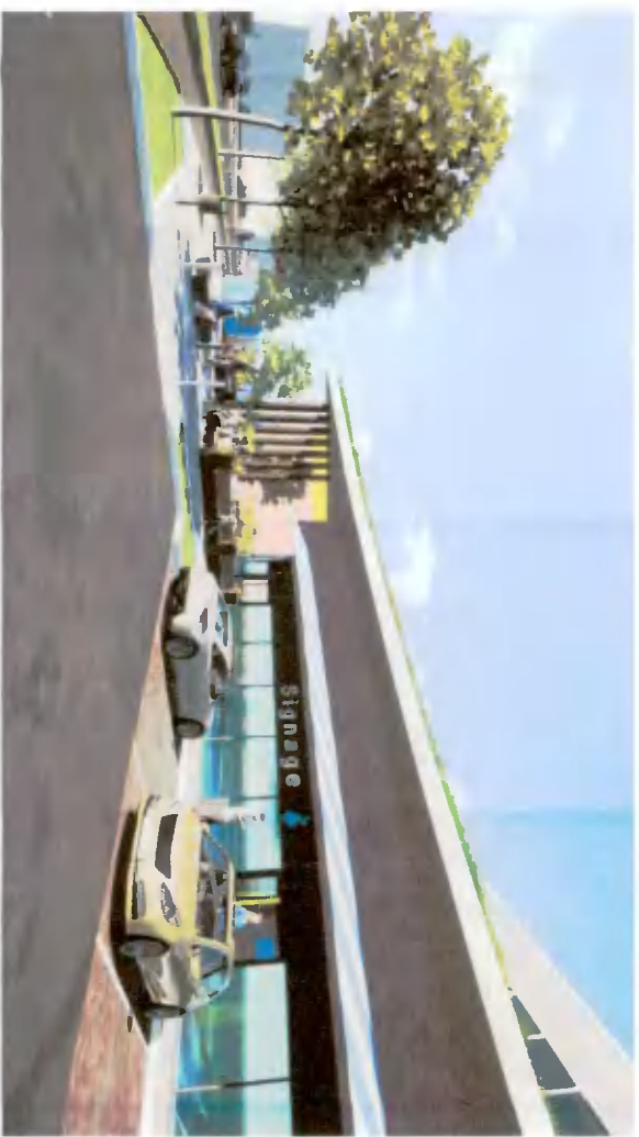
View of Coffee Shop