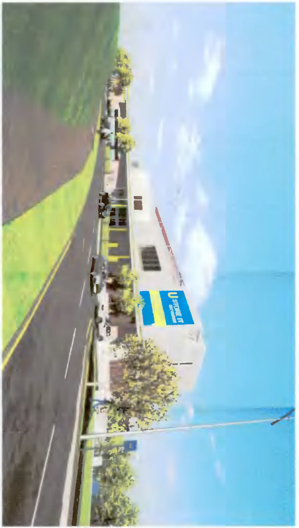
View from South-East