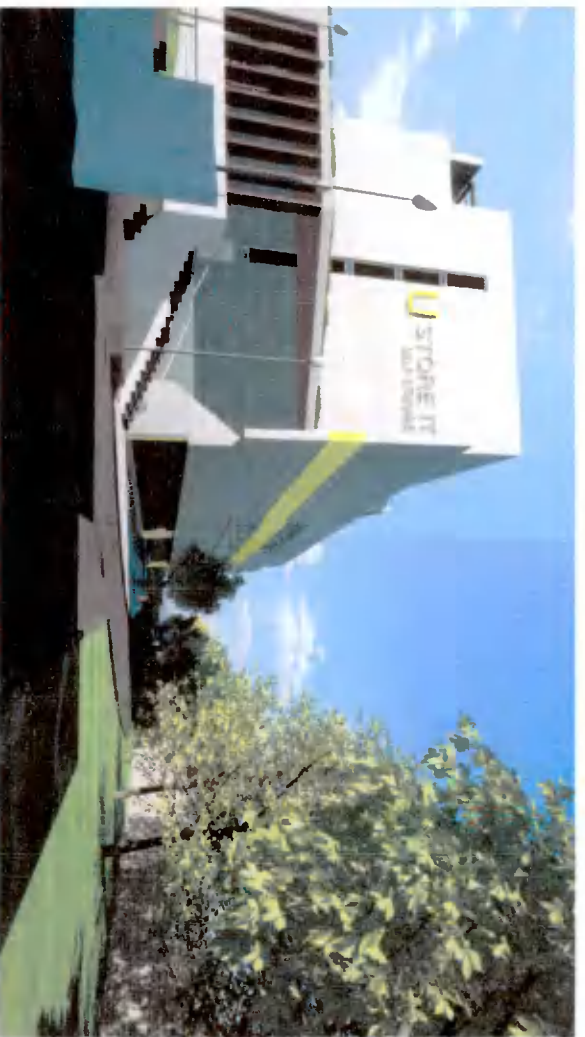
Basement Car Park Facing West