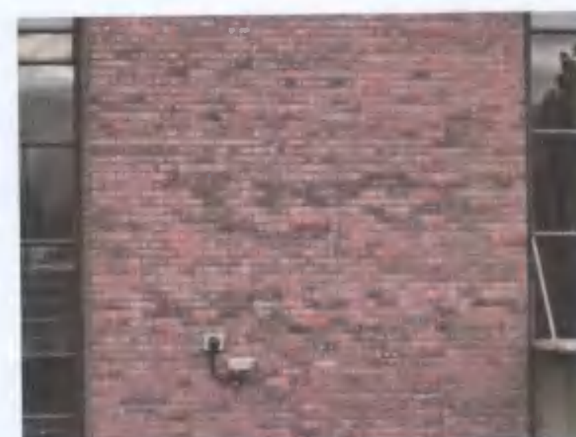
Example of proposed brick from existing Johnson & Johnson building.

For drainage layouts and details refer to drawings/report by GDCL.