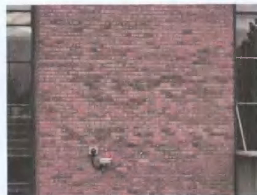
Example of proposed brick from existing Johnson & Johnson building.

For drainage layouts and details refer to drawings/report by GDCL.