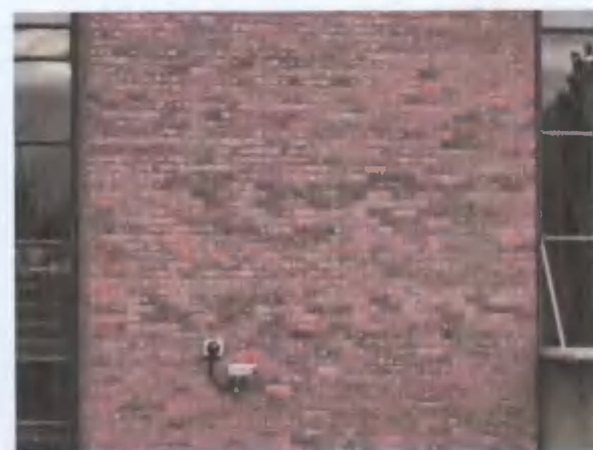
Example of proposed brick from existing Johnson & Johnson building.

For drainage layouts and details refer to drawings/report by GDCL.