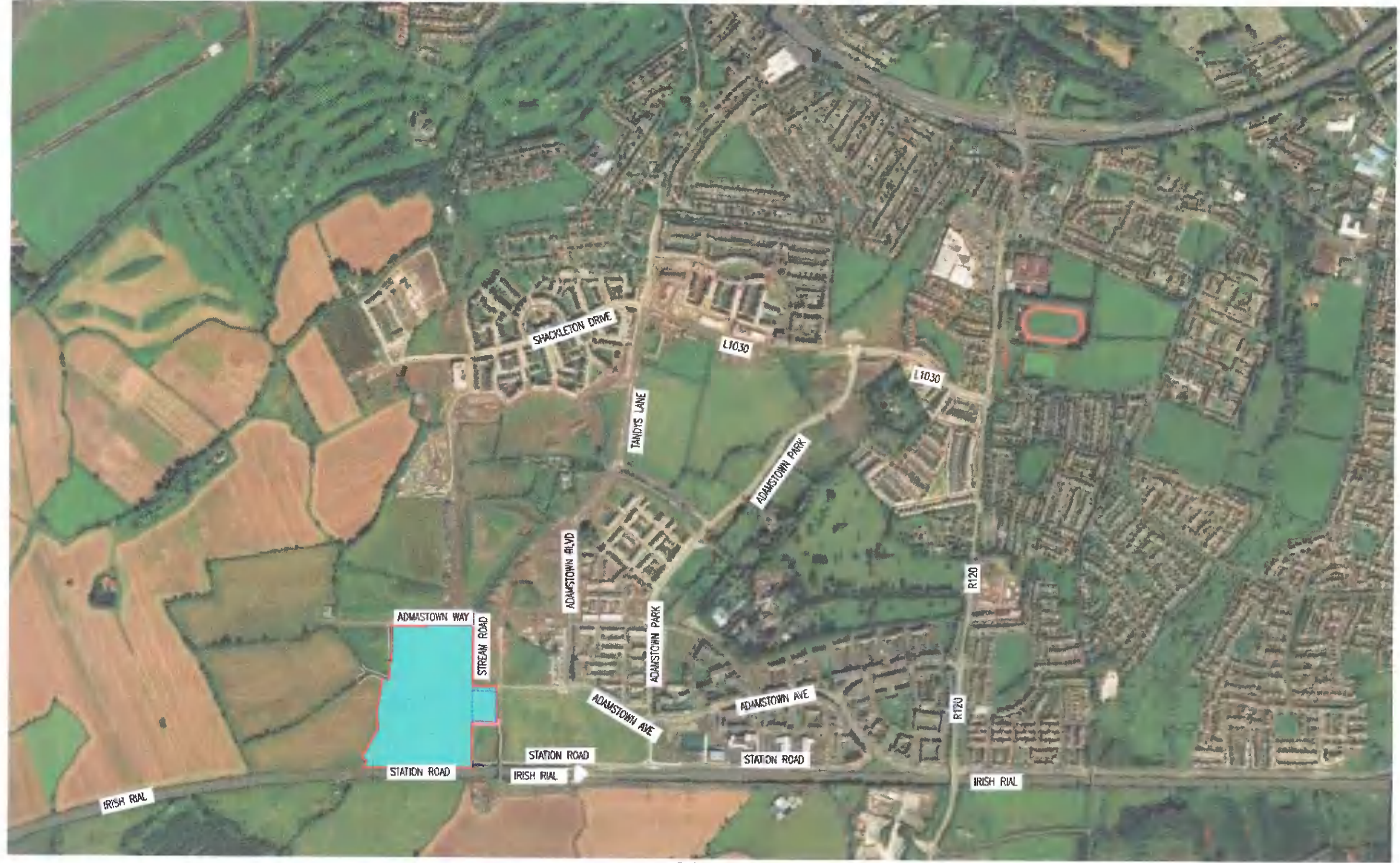
SITE LOCATION SCALE 1:10000