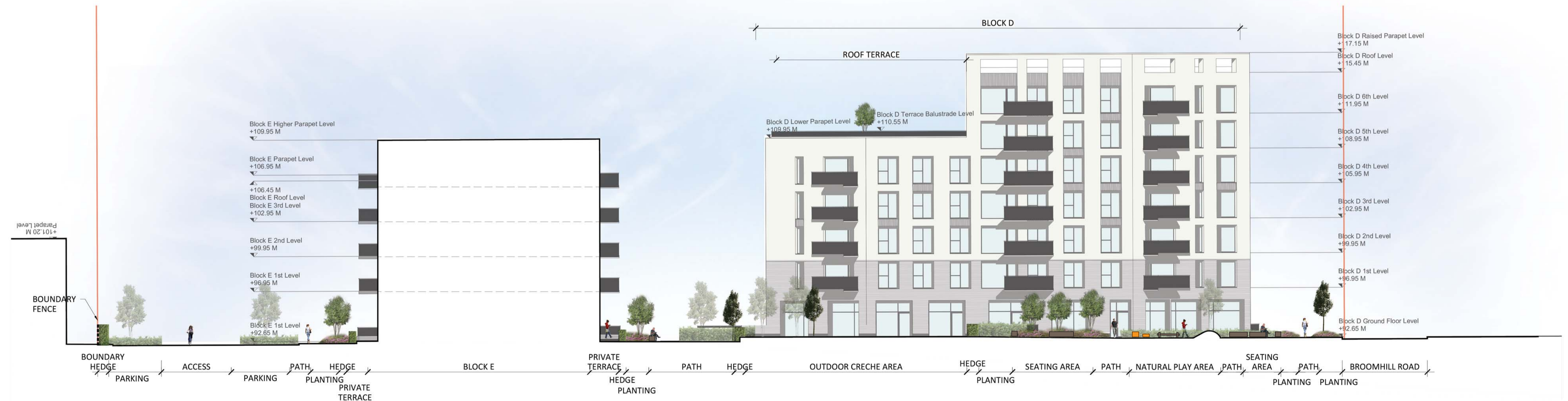
02 SECTION BB Section