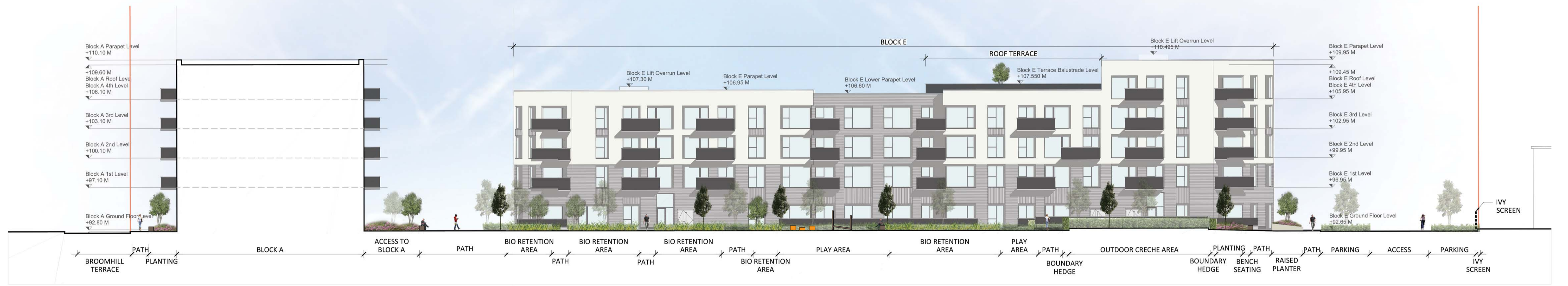
01 SECTION AA Section