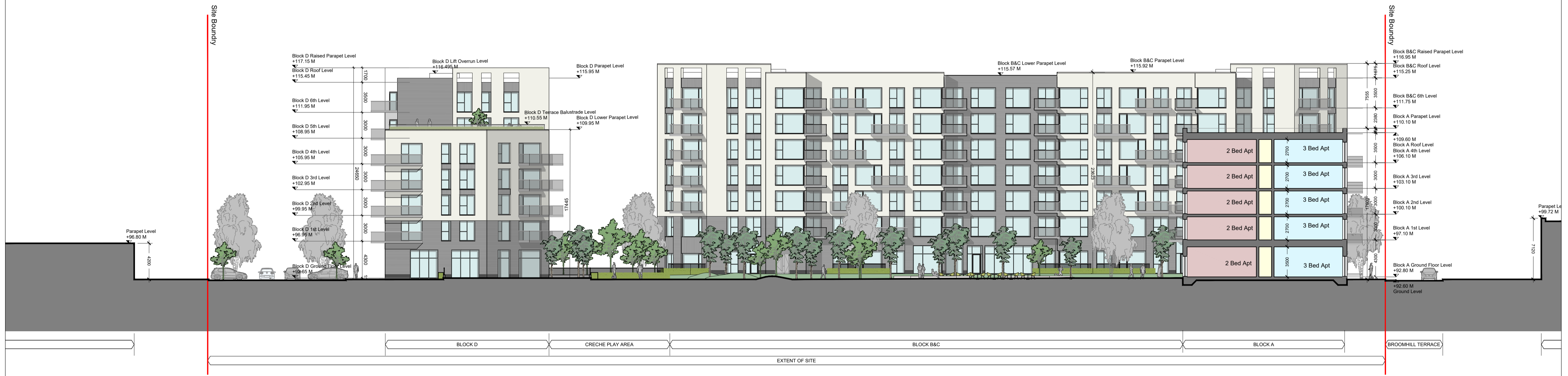
02 Section J-J PP5002 SERIES 50 SECTIONS 1:250