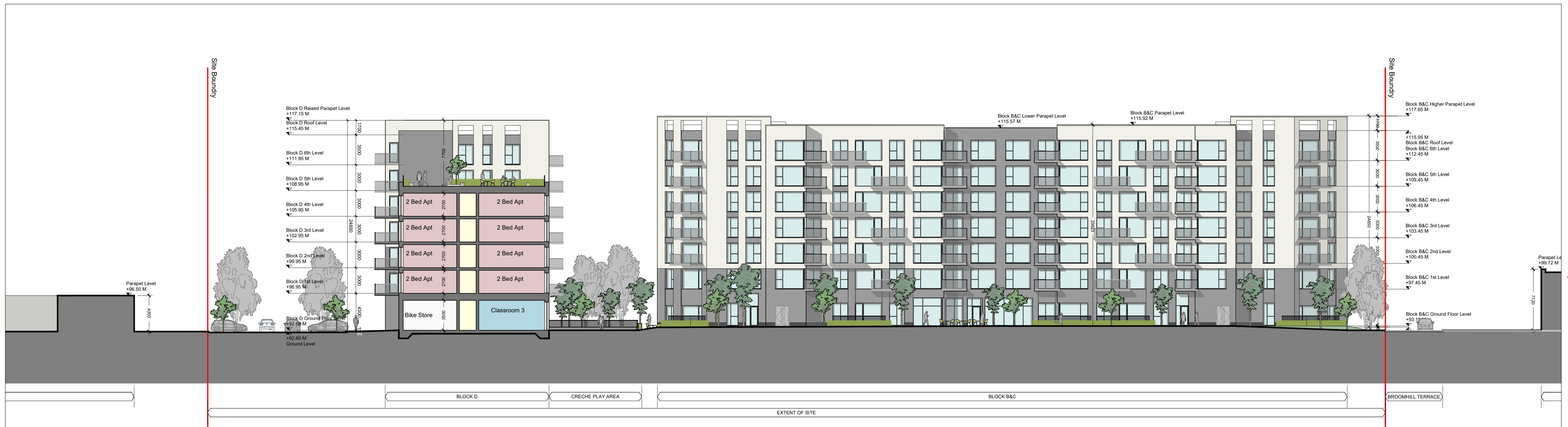
01 Section I-I PP5002 SERIES 50 SECTIONS 1:250