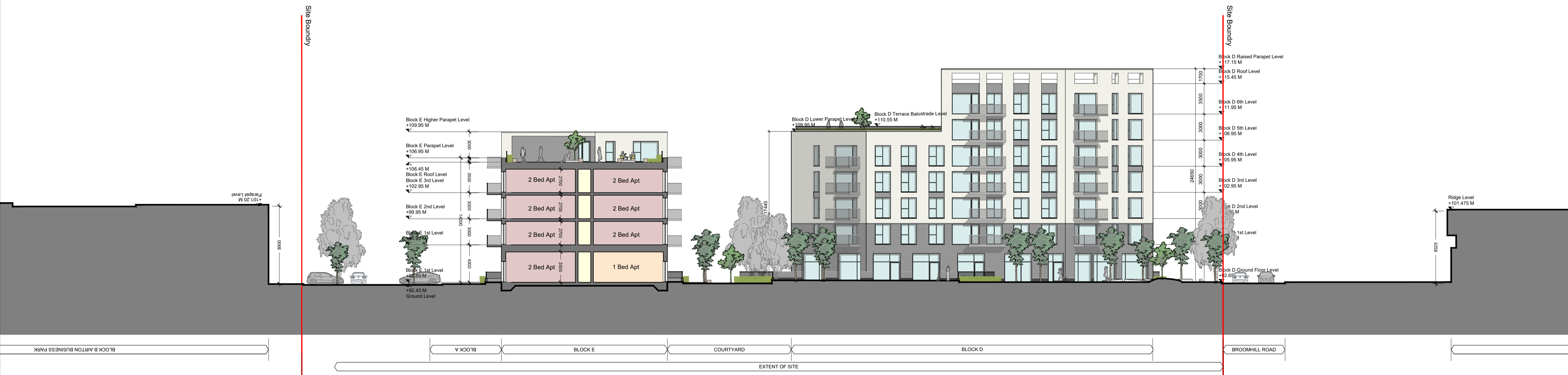
02 Section H-H PP5002 SERIES 50 SECTIONS