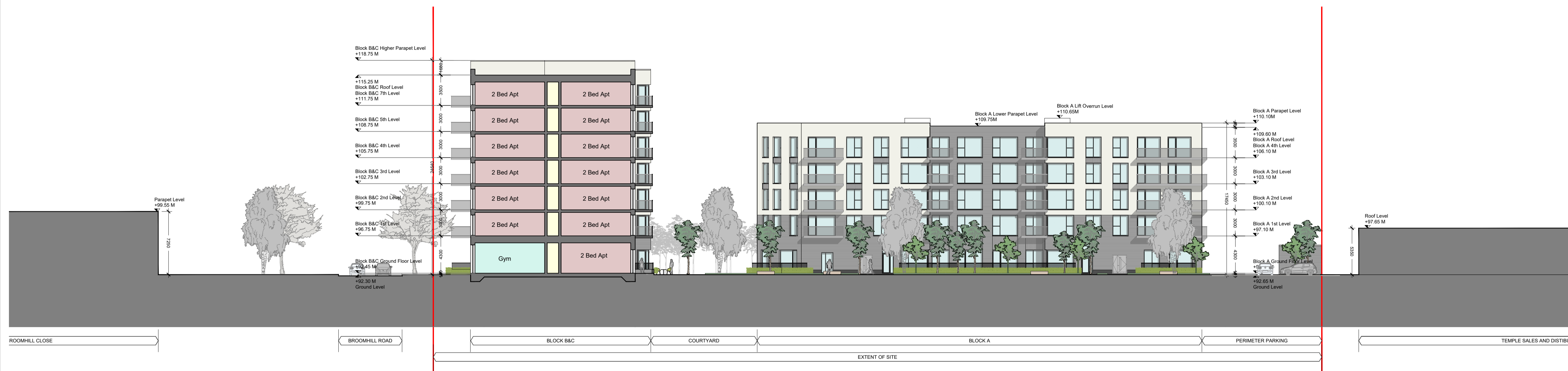
01 Section G-G PP5002 SERIES 50 SECTIONS