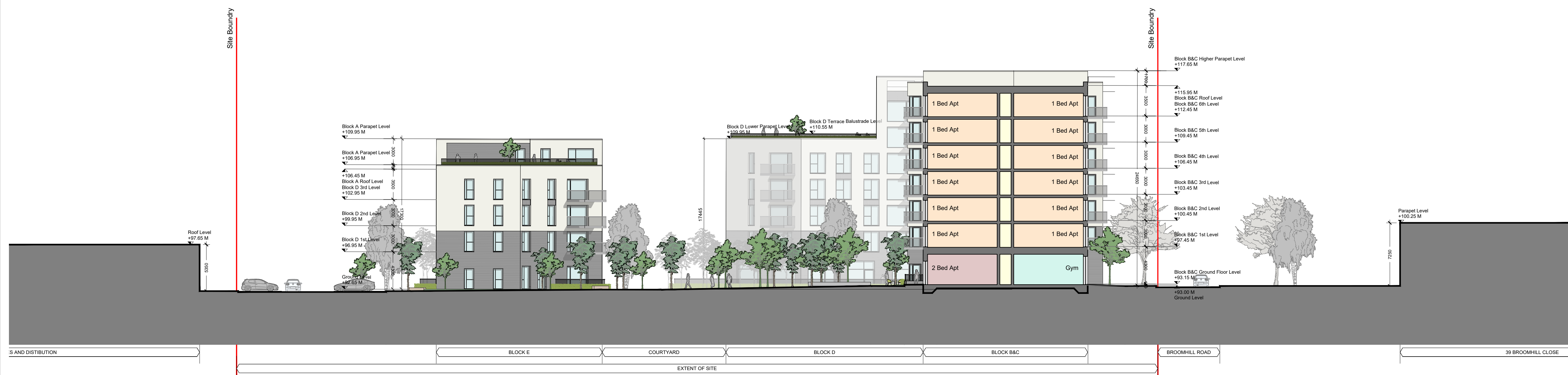
02 Section D-D PP5001 SERIES 50 SECTIONS 1:250