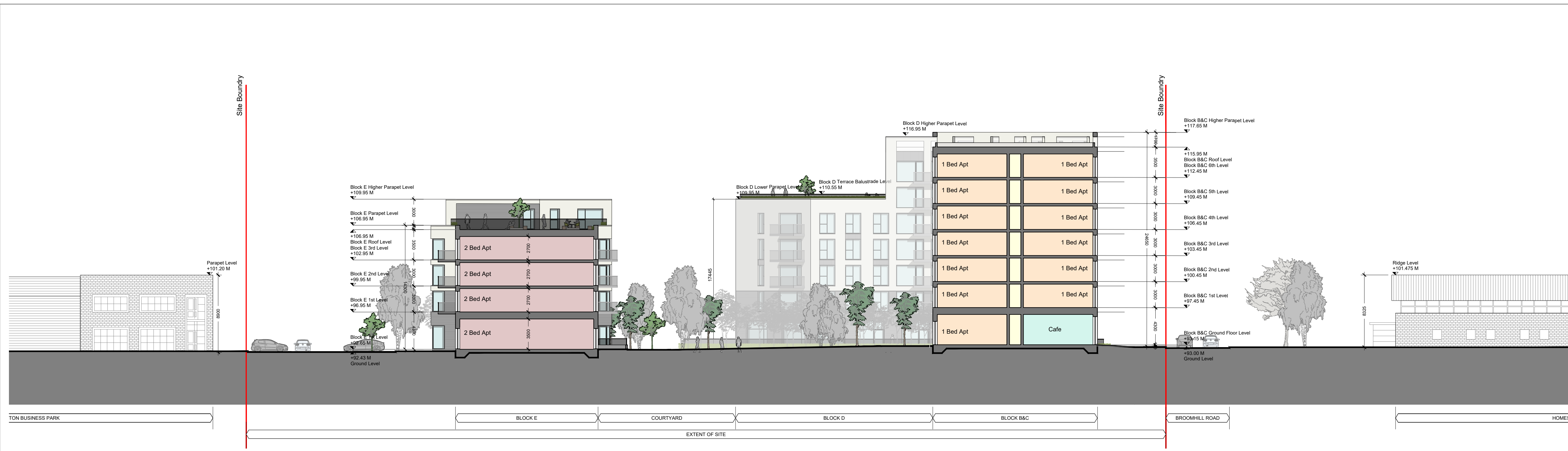
01 Section C-C PP5001 SERIES 50 SECTIONS 1:250