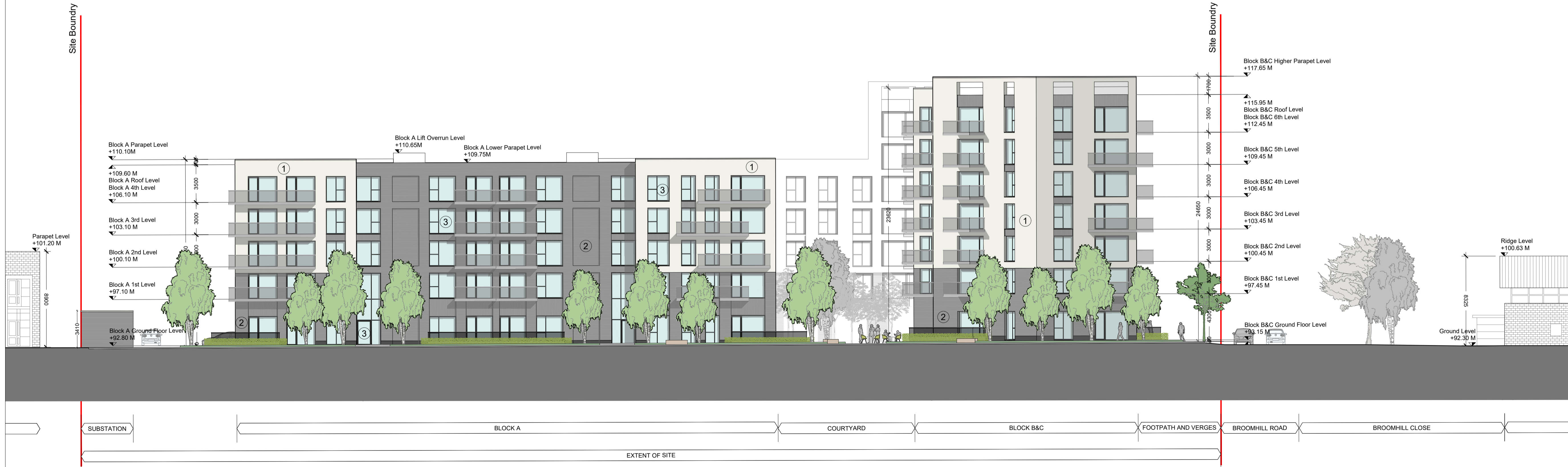
02 Street Elevation - North (2) PP4001 SERIES 40 ELEVATIONS 1:200