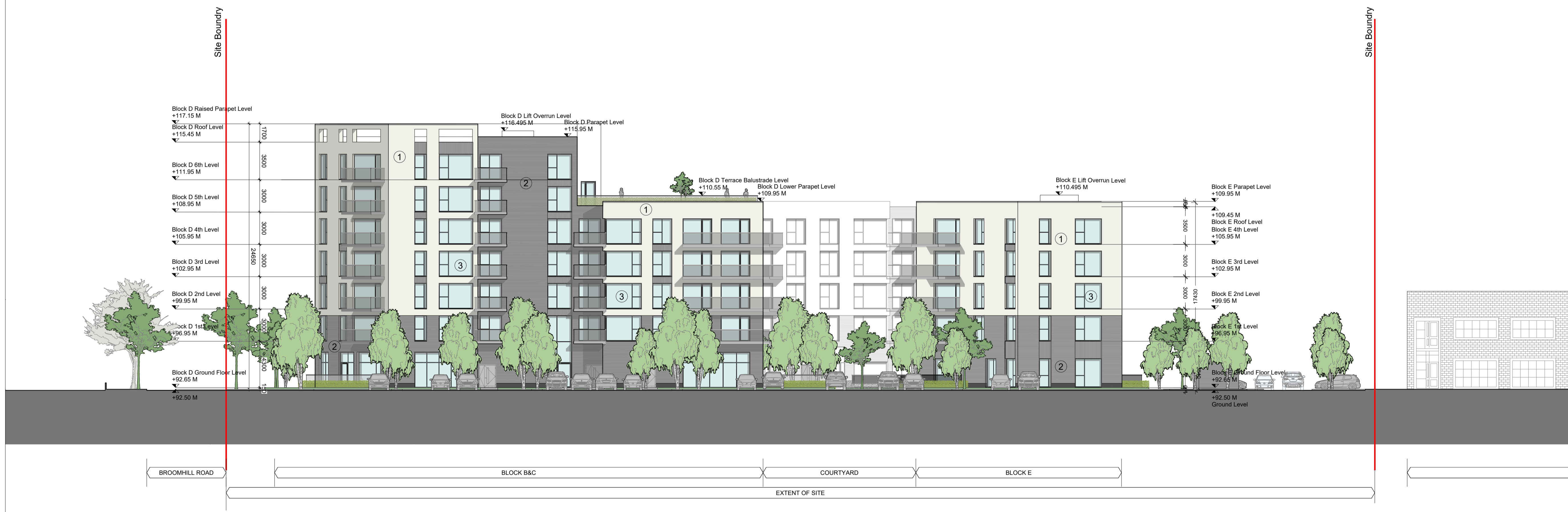
01 Street Elevation - South (1) PP4001 SERIES 40 ELEVATIONS 1:200