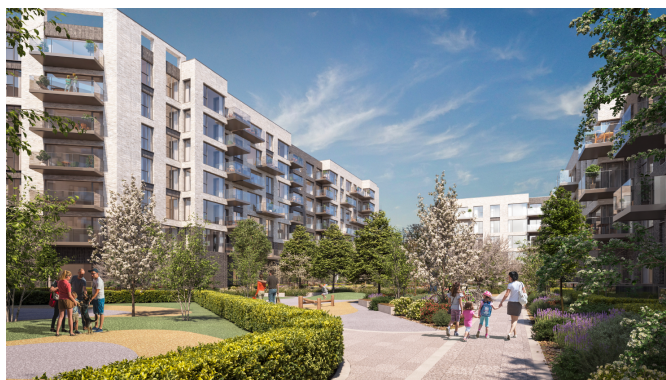
CGI of Proposal

The Property Manager will instruct independent and comprehensive General Risk Assessment to be completed by an appointed surveyor prior to occupation of the building.