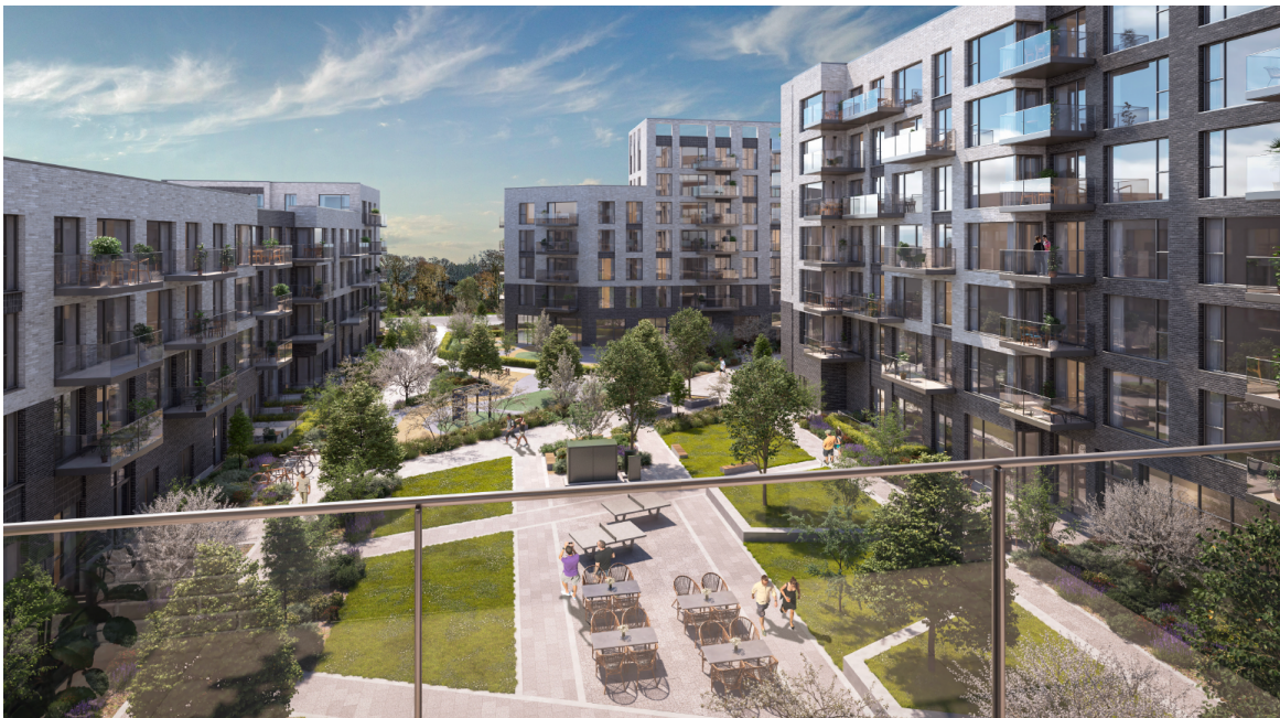
CGI of Proposal

The Property Manager will be responsible for the management of service contractors for critical elements such as pest control, cleaning and exterior window cleaning for the residential areas through boom lift, cherry picker (overhead extending lift arm) where appropriate. All external soft landscaped areas will be communal amenity space and public open space not to be taken in charge and as such will be maintained by the appointed contractor.