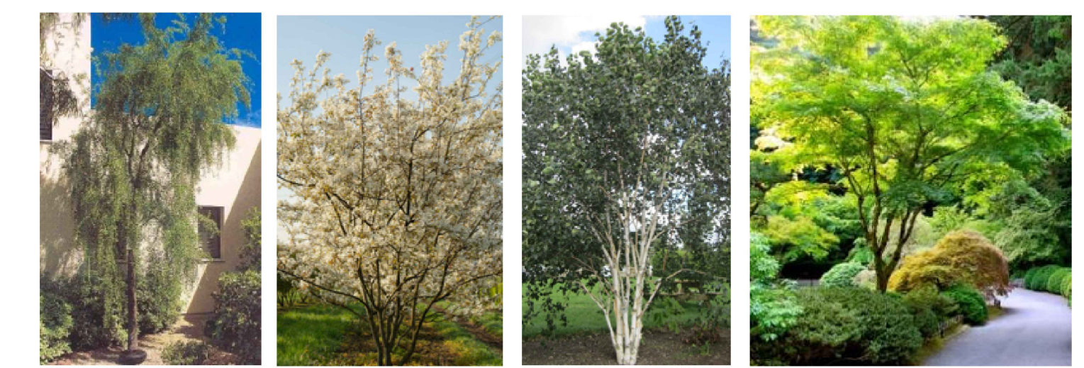
Betula pendula 'Tristis' - Narrow Weeping Birch Amelanchier lamarckii Multi-stem Betula utilis Jacquemontii Acer palmatum Japanese Maple