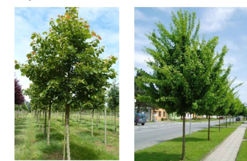
Tilia cordata 'Greenspire' - Small-Leaved Lime Acer campestre 'Eisrijk'