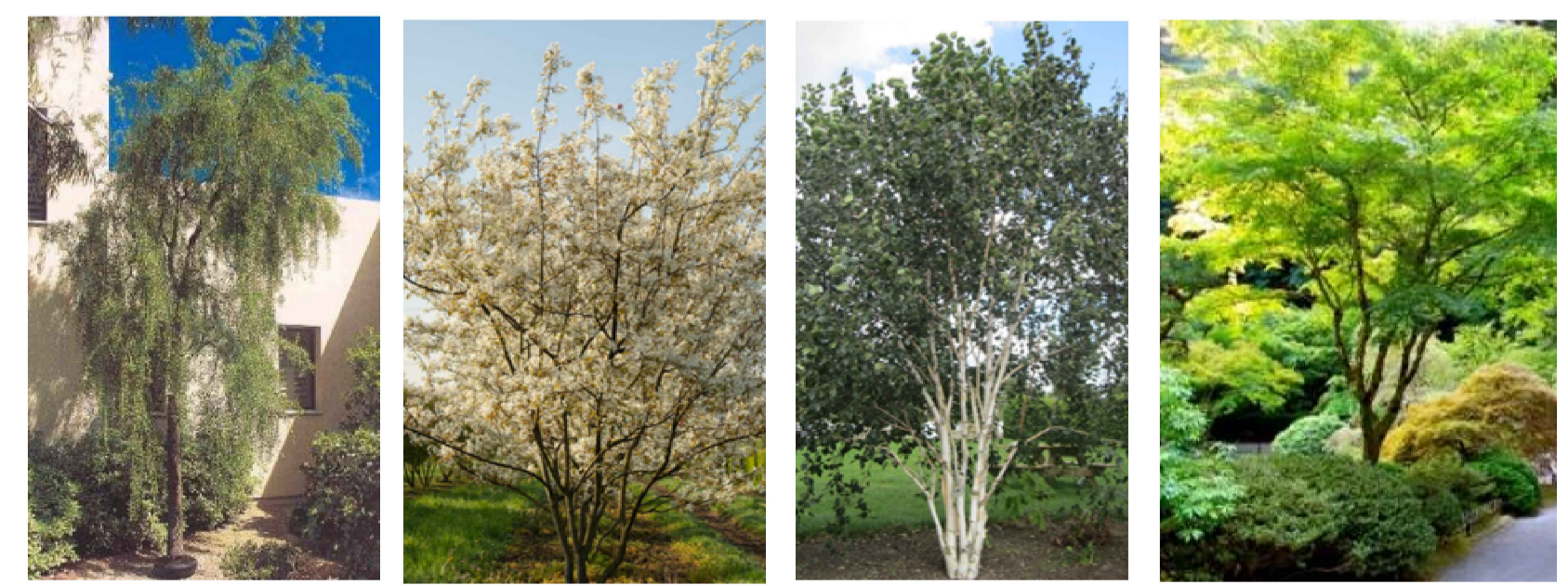
Betula pendula 'Tristis' – Amelanchier lamarckii Narrow Weeping Birch Multi-stem Betula utilis Jacquemontii Acer palmatum Japanese Maple