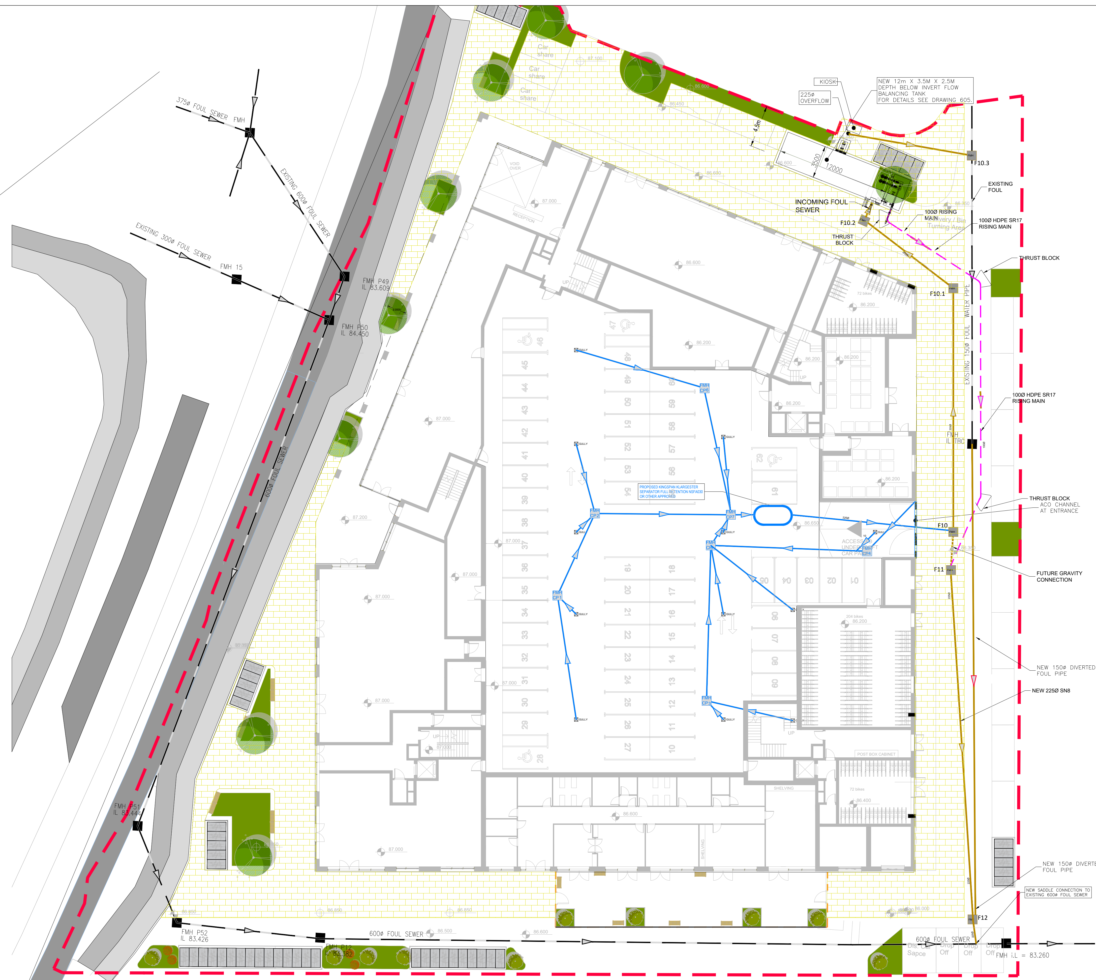
PROPOSED CARPARK SURFACE WATER DRAINAGE LAYOUT SCALE 1:200