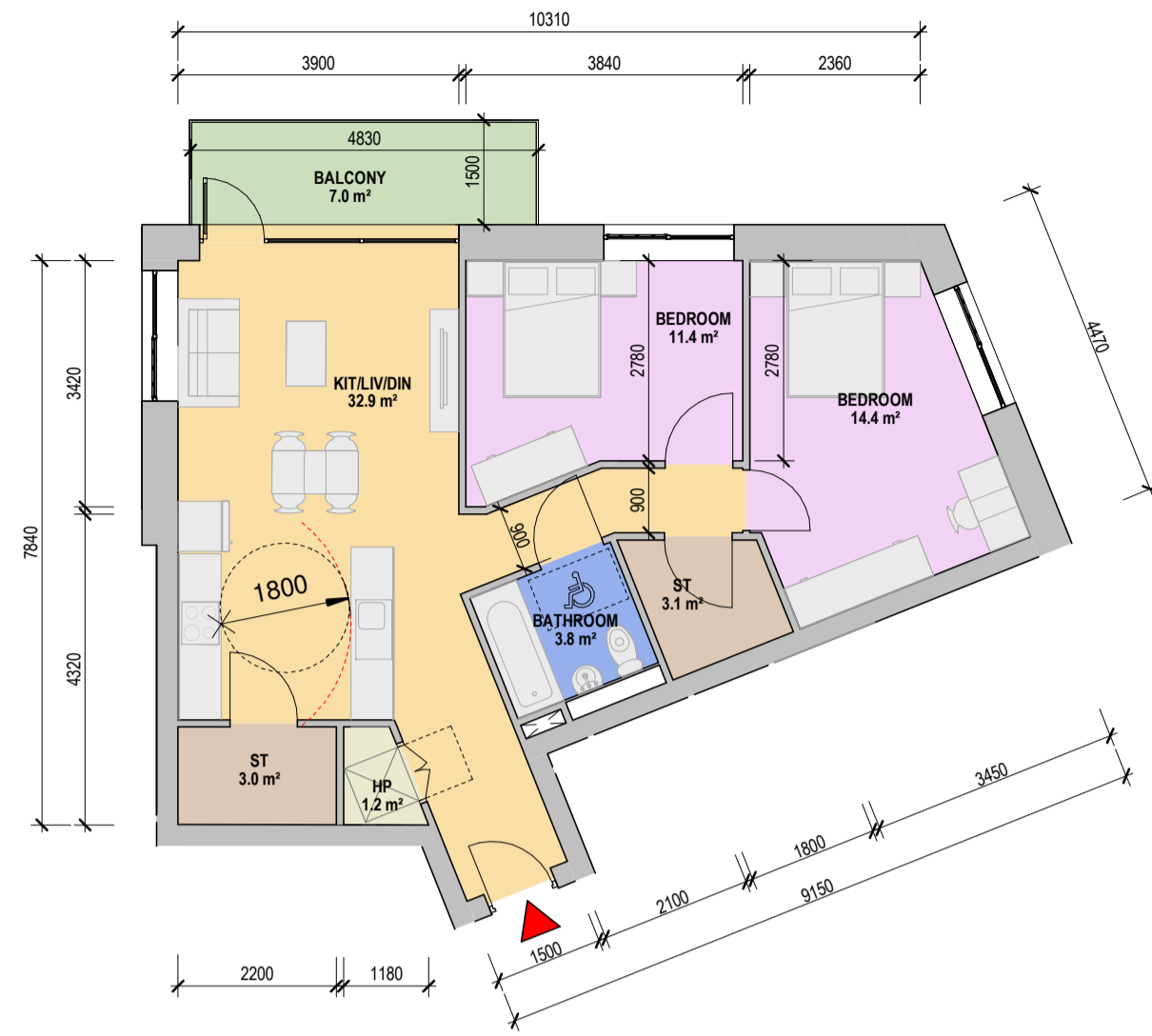
2 APT TYPE - 2J 1 : 100

APARTMENT TYPE 2I - 2 BED, 4 PERSON APARTMENT - GROSS INTERNAL AREA (GIA) 85.5 sqm (min req. 73 sqm) - DUAL ASPECT