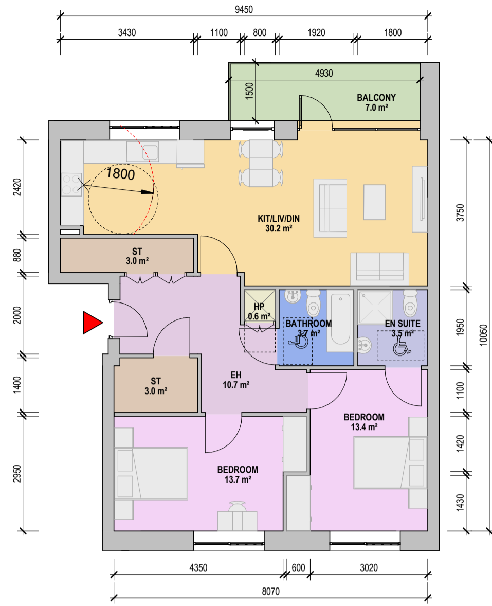
1 APT TYPE - 2I 1 : 100

FLOOR PLAN KEY: EH - ENTRANCE HALL ST - STORAGE HP - HOT PRESS KIT/LIV/DIN - KITCHEN + LIVING + DINING ROOM