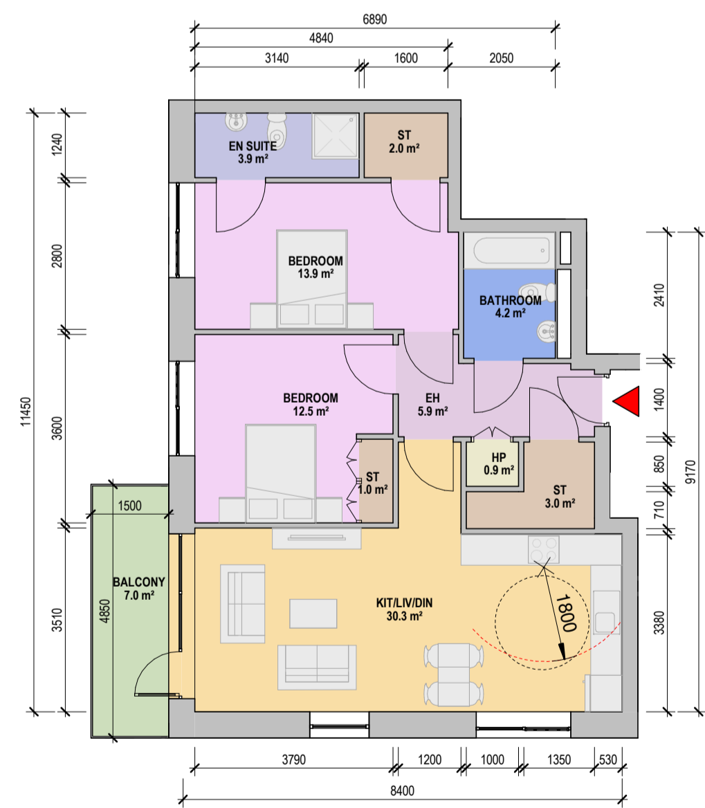
6 APT TYPE - 2N 1 : 100

APARTMENT TYPE 2M - 2 BED, 4 PERSON APARTMENT - GROSS INTERNAL AREA (GIA) 73.5 sqm (min req. 73 sqm) - SINGLE ASPECT