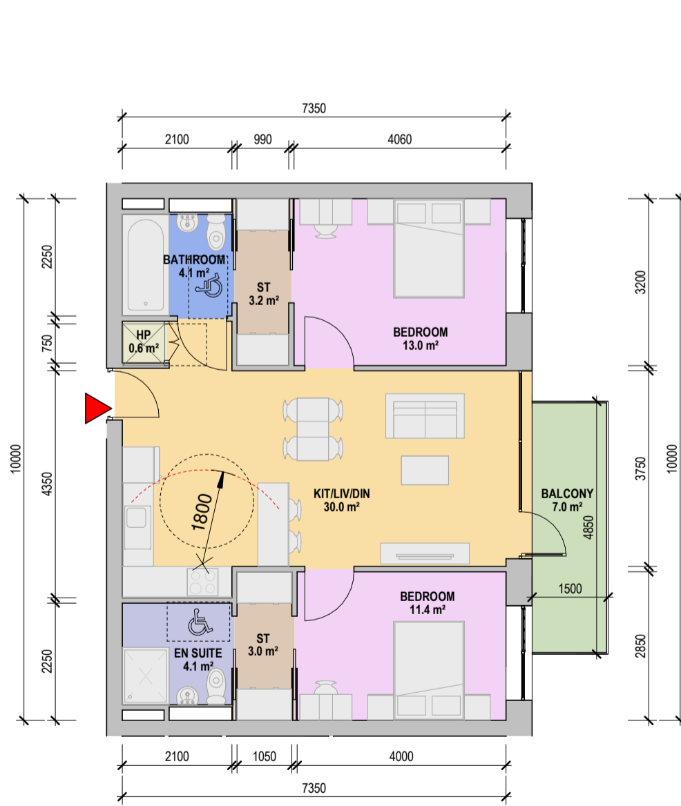
5 APT TYPE - 2M 1 : 100

APARTMENT TYPE 2M - 2 BED, 4 PERSON APARTMENT - GROSS INTERNAL AREA (GIA) 73.5 sqm (min req. 73 sqm) - SINGLE ASPECT