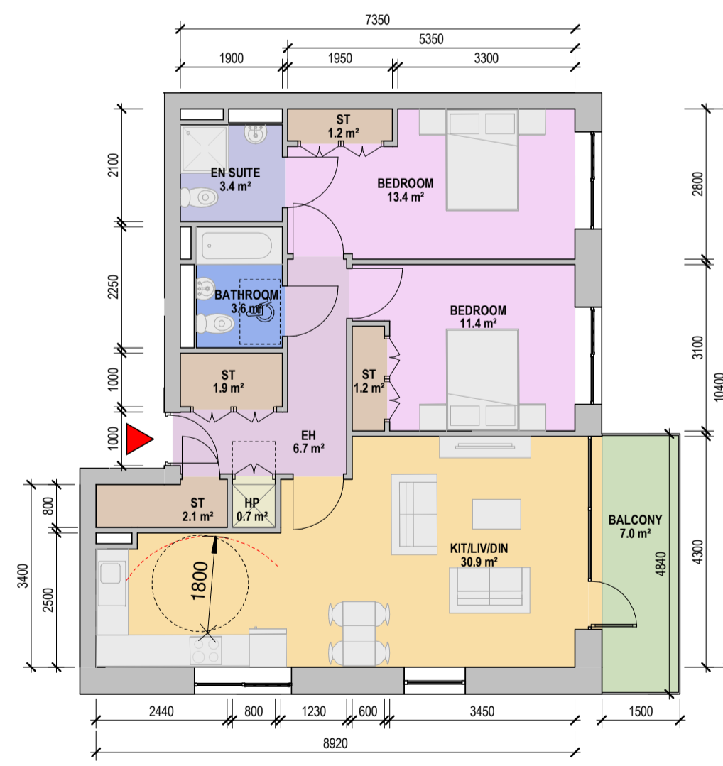
7 APT TYPE - 2O 1 : 100

APARTMENT TYPE 2N - 2 BED, 4 PERSON APARTMENT - GROSS INTERNAL AREA (GIA) 81.8 sqm (min req. 73 sqm) - DUAL ASPECT