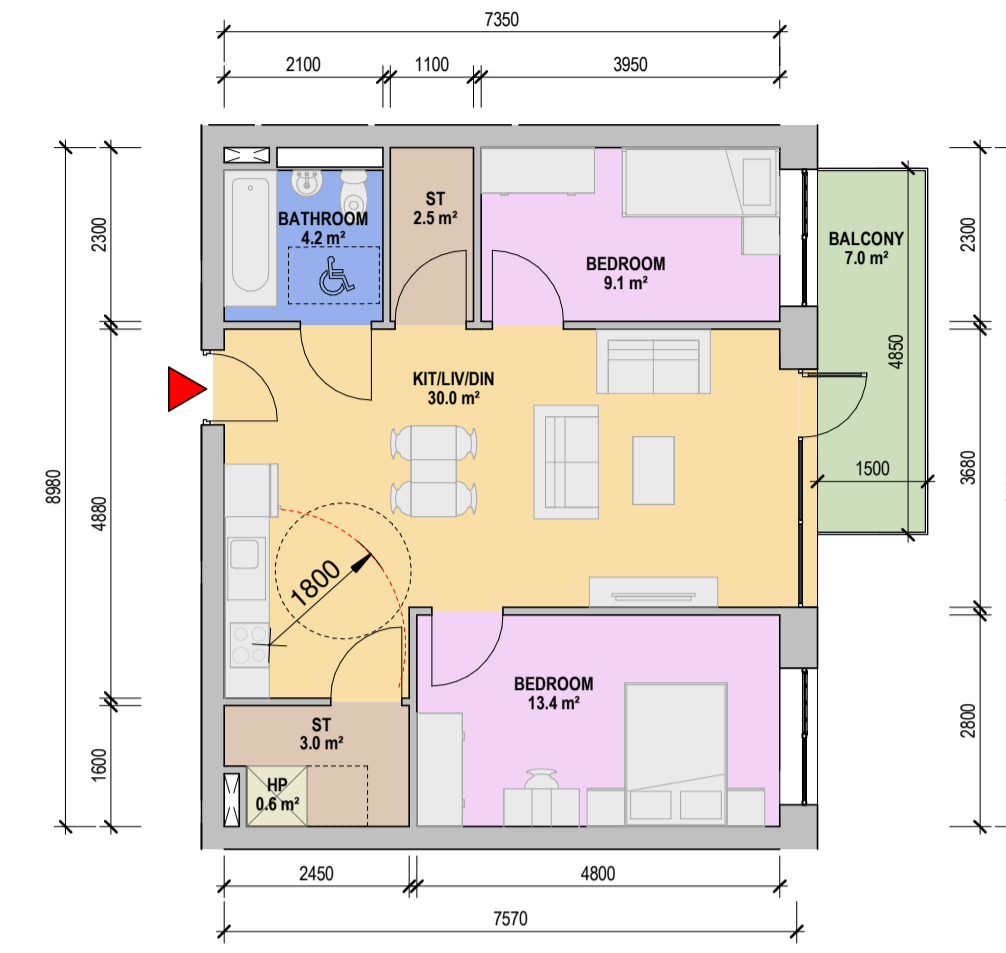
4 APT TYPE - 2L 1 : 100

APARTMENT TYPE 2K - 2 BED, 4 PERSON APARTMENT - GROSS INTERNAL AREA (GIA) 81.4 sqm (min req. 73 sqm) - SINGLE ASPECT