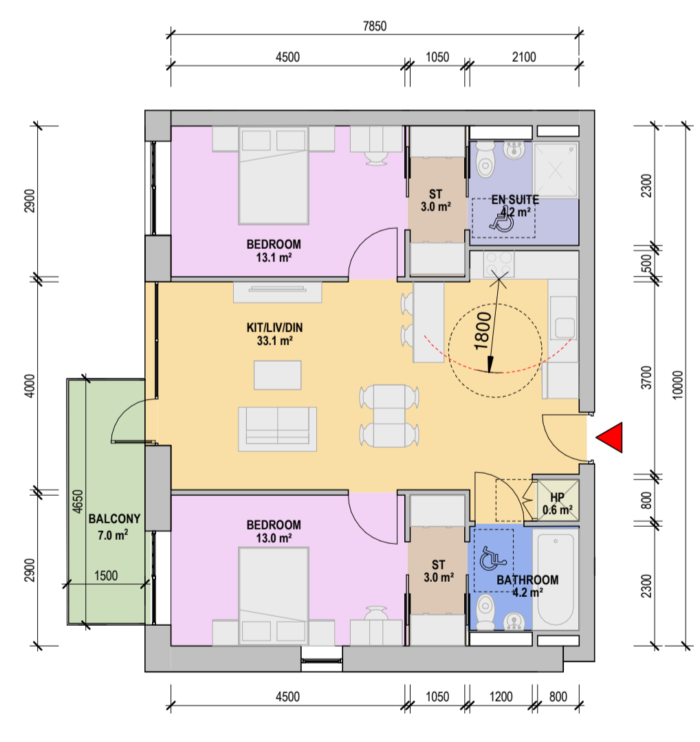
6 APT TYPE - 2F 1 : 100

APARTMENT TYPE 2E - 2 BED, 4 PERSON APARTMENT - GROSS INTERNAL AREA (GIA) 80.8 sqm (min req. 73 sqm) - DUAL ASPECT