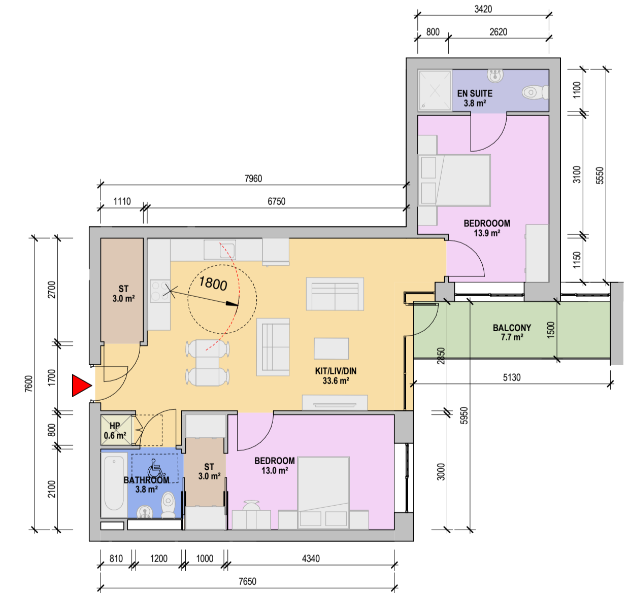
8 APT TYPE - 2H 1 : 100

APARTMENT TYPE 2G - 2 BED, 4 PERSON APARTMENT - GROSS INTERNAL AREA (GIA) 82.2 sqm (min req. 73 sqm) - DUAL ASPECT