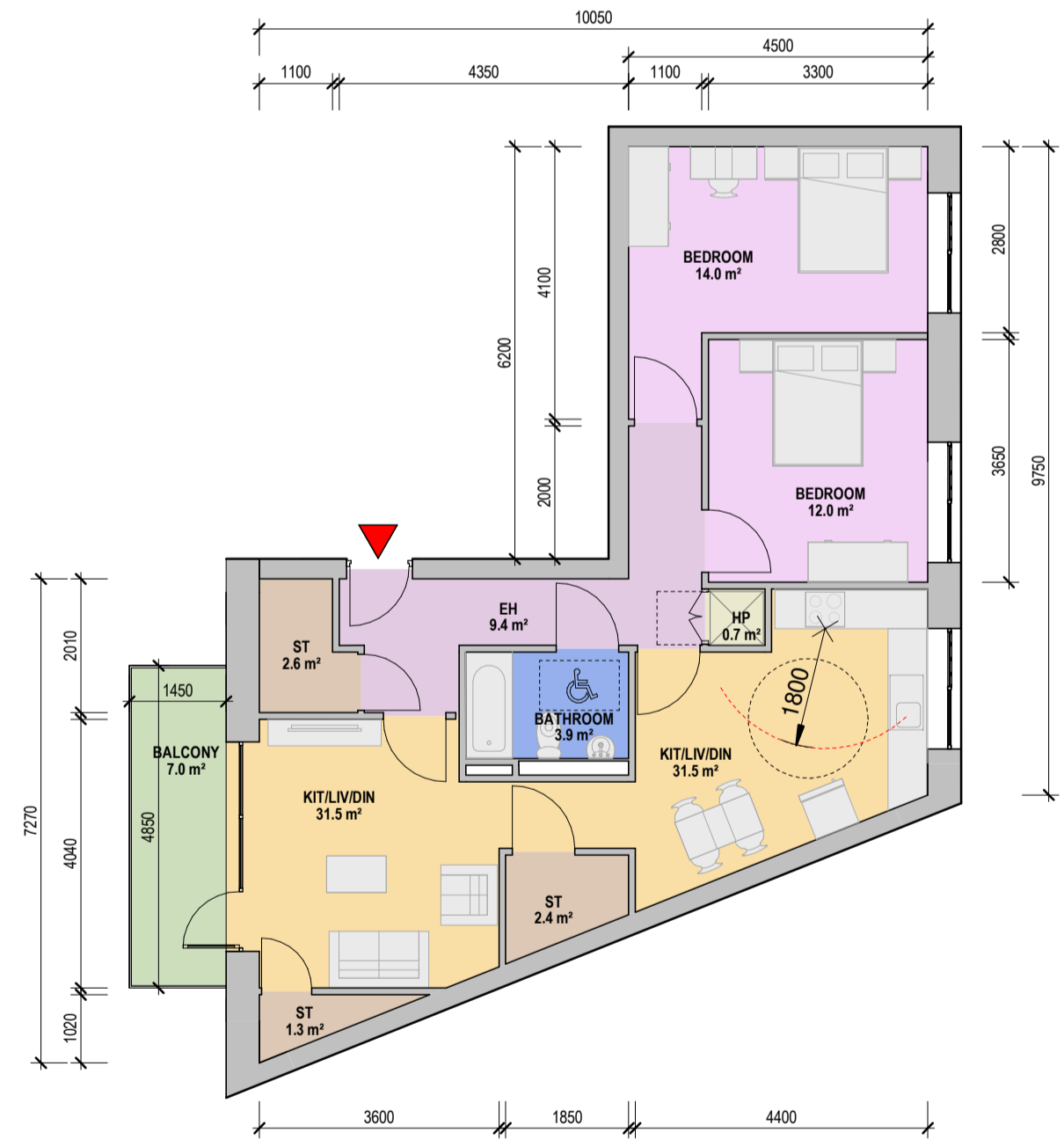
7 APT TYPE - 2G 1 : 100

APARTMENT TYPE 2F - 2 BED, 4 PERSON APARTMENT - GROSS INTERNAL AREA (GIA) 78.5 sqm (min req. 73 sqm) - DUAL ASPECT