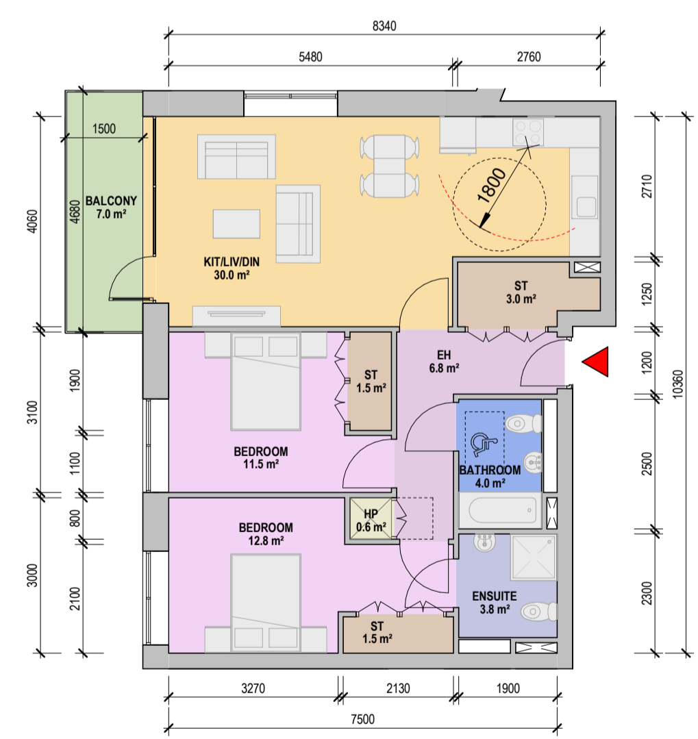
5 APT TYPE - 2E 1 : 100

APARTMENT TYPE 2E - 2 BED, 4 PERSON APARTMENT - GROSS INTERNAL AREA (GIA) 80.8 sqm (min req. 73 sqm) - DUAL ASPECT