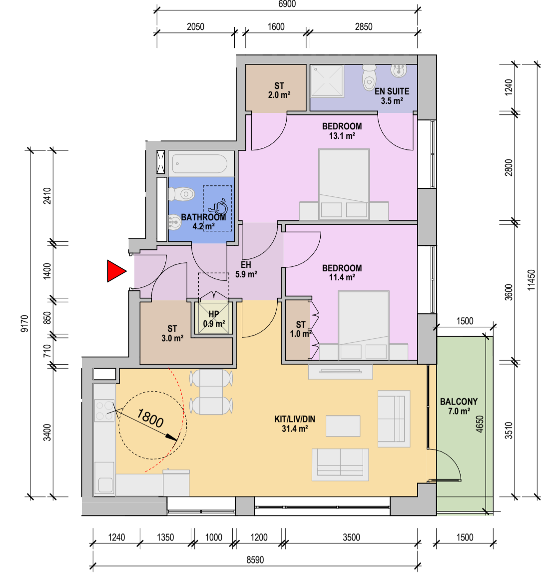
2 APT TYPE - 2B 1 : 100

APARTMENT TYPE 2A - 2 BED, 4 PERSON APARTMENT - GROSS INTERNAL AREA (GIA) 80.8 sqm (min req. 73 sqm) - DUAL ASPECT