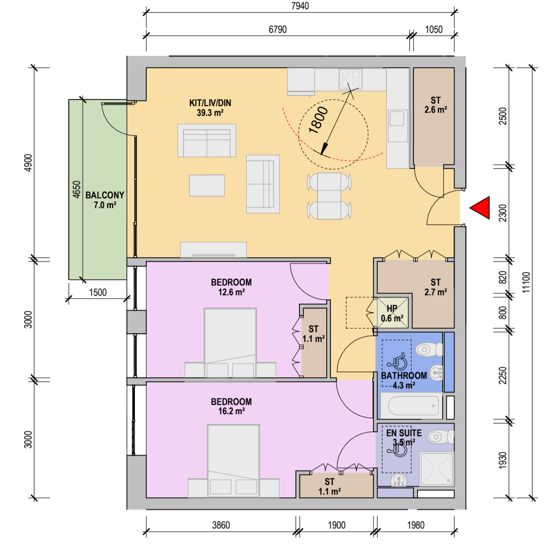
4 APT TYPE - 2D 1 : 100

APARTMENT TYPE 2C - 2 BED, 4 PERSON APARTMENT - GROSS INTERNAL AREA (GIA) 78.1 sqm (min req. 73 sqm) - SINGLE ASPECT