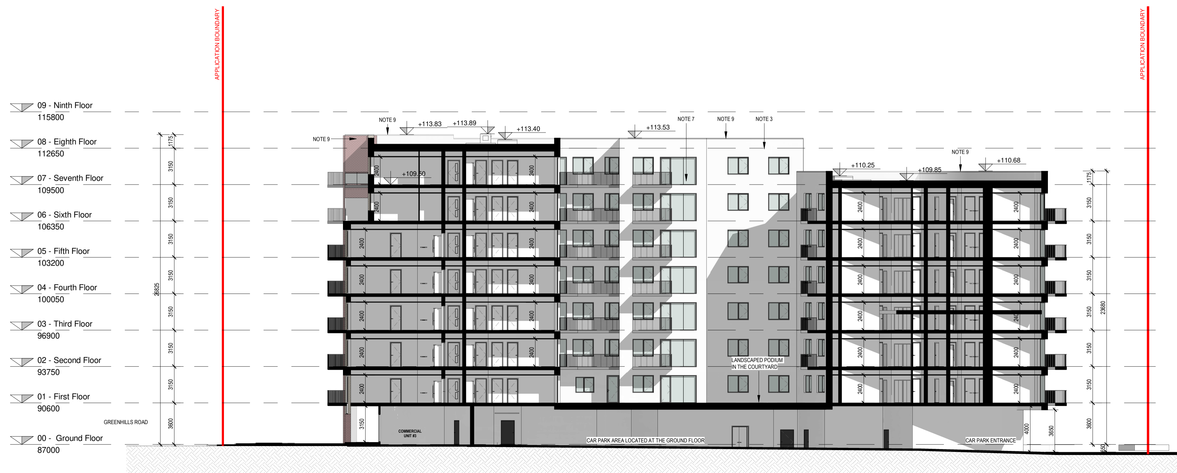
2 PROPOSED COURTYARD - NORTH - EAST ELEVATION