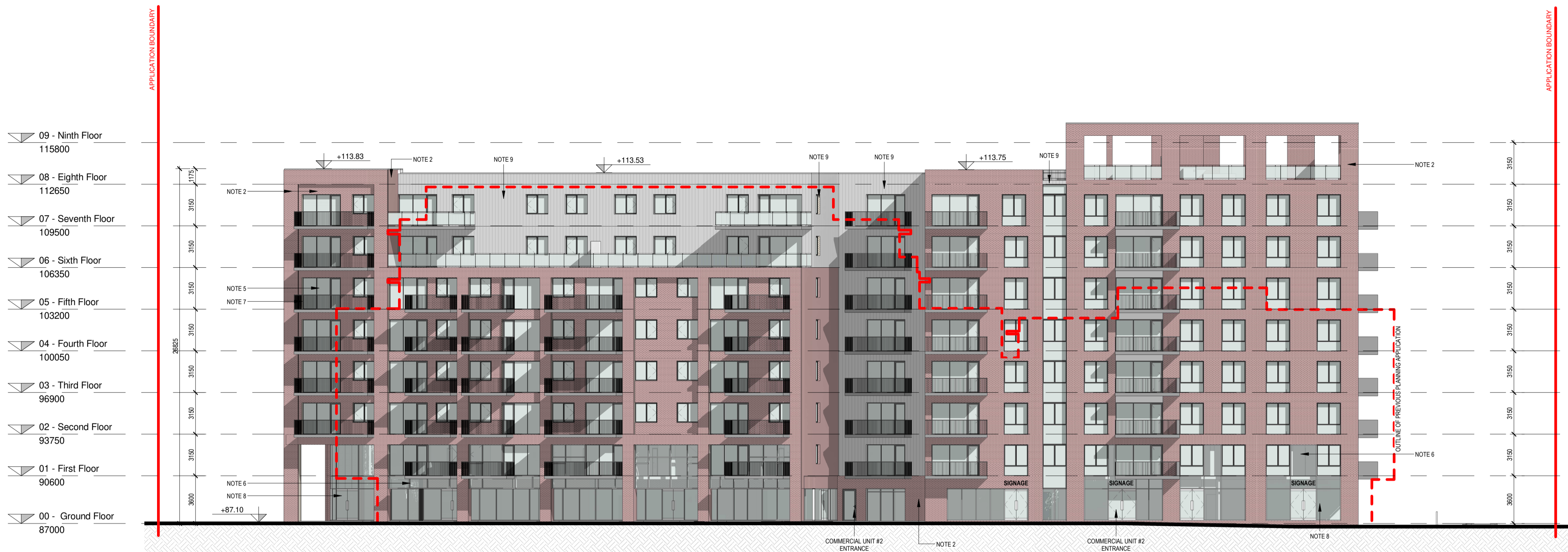
1 PROPOSED WEST ELEVATION