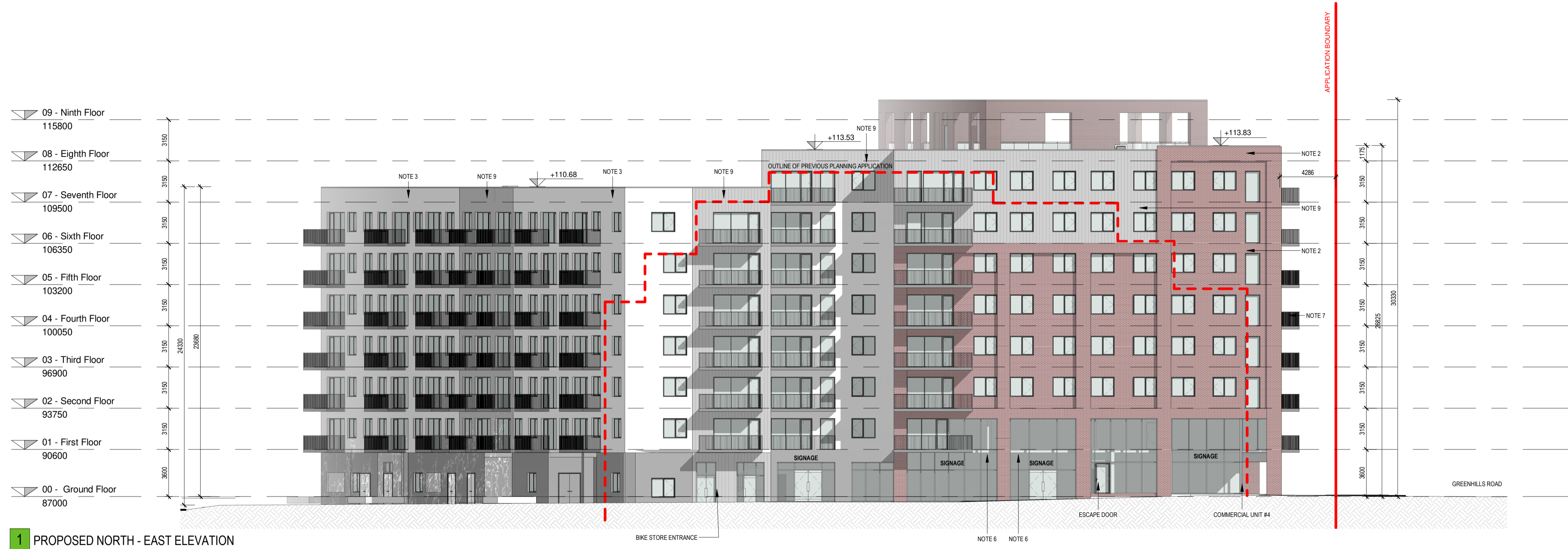
1 PROPOSED NORTH - EAST ELEVATION