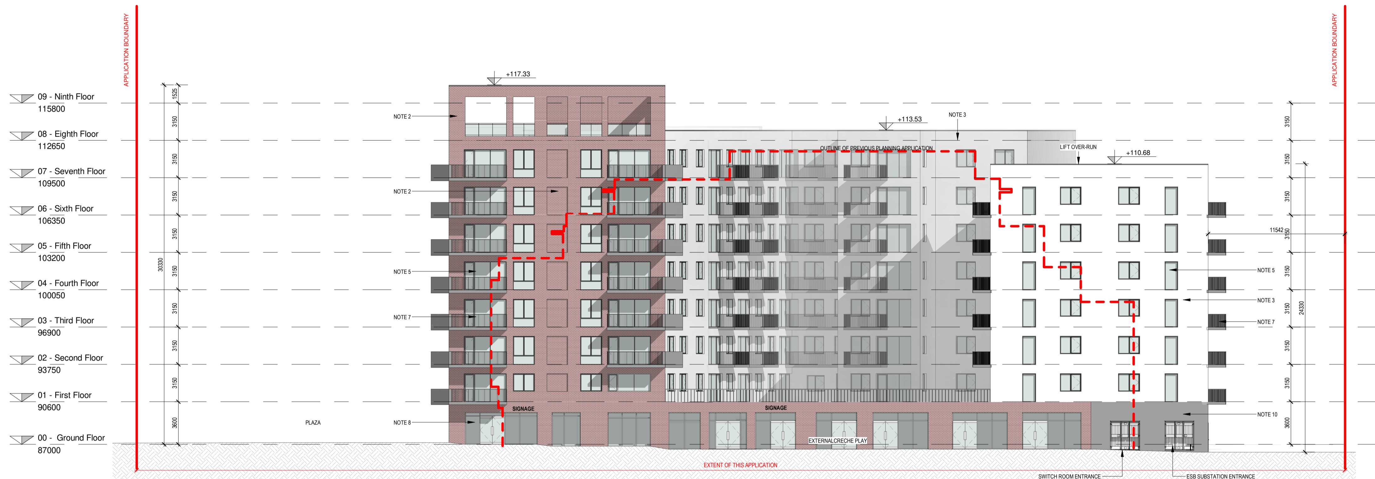
1 PROPOSED SOUTH ELEVATION 1 : 200