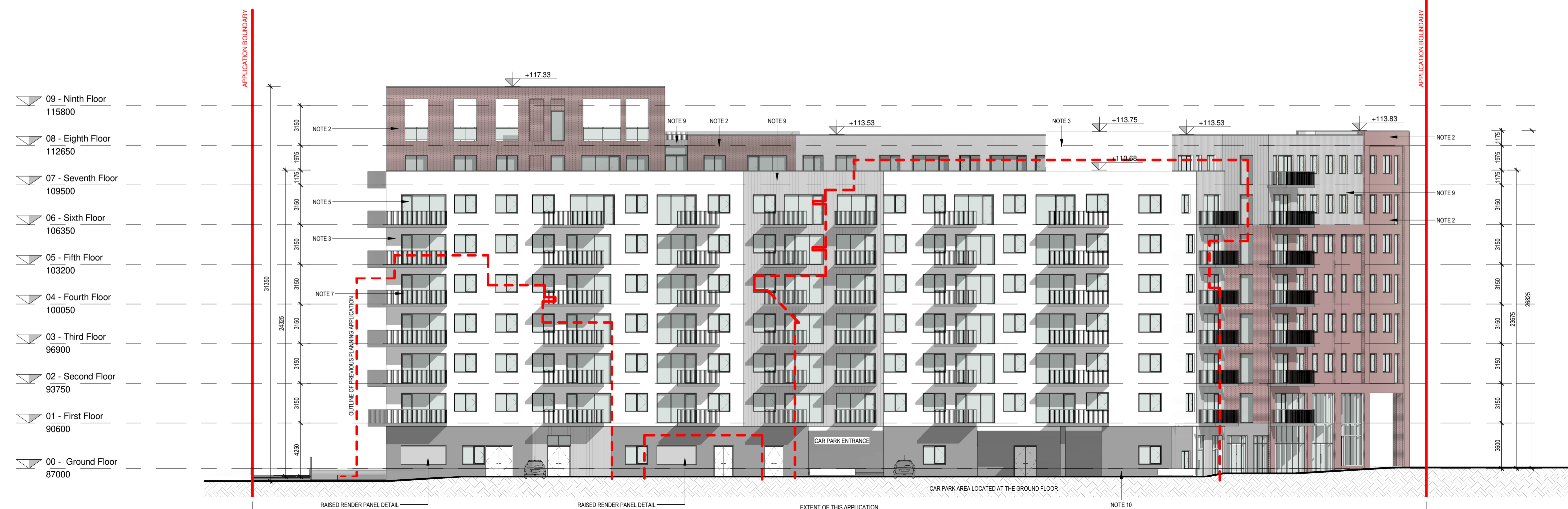
2 PROPOSED EAST ELEVATION 1 : 200