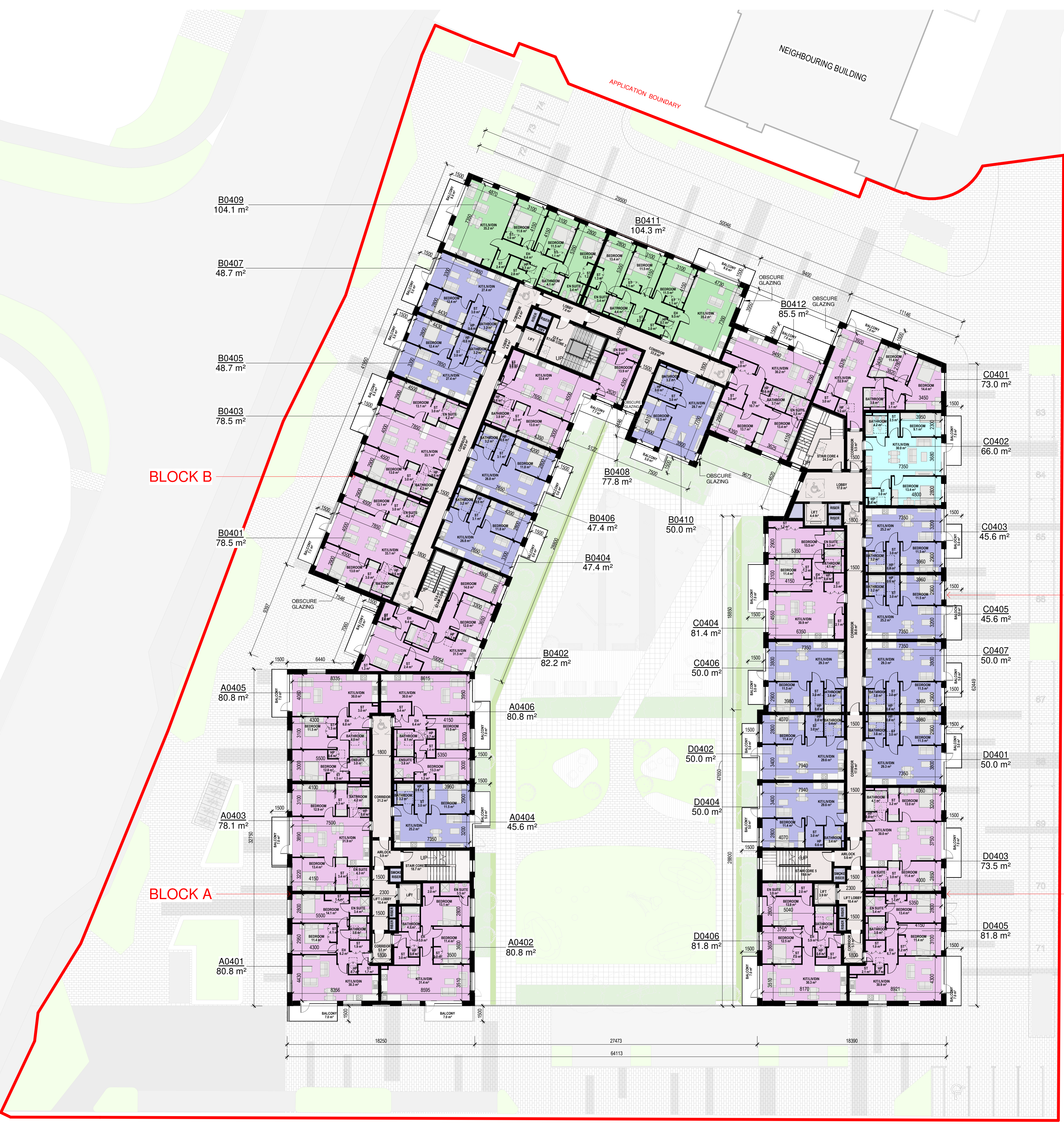
1 04 - PROPOSED FOURTH FLOOR PLAN 1:200

Please consider the environment before printing this sheet