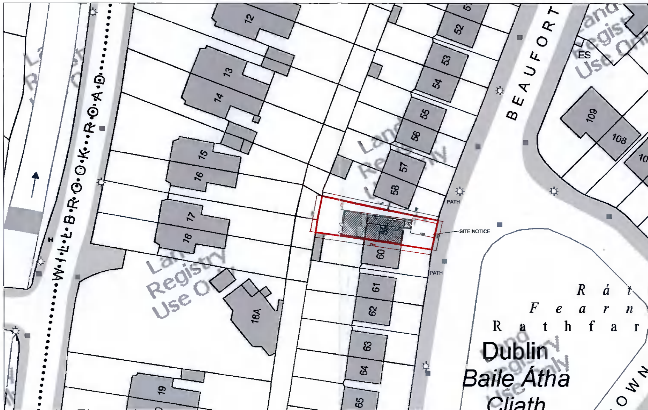
SITE LAYOUT MAP SCALE 1:500 AREA OF SITE OUTLINED IN RED = 192sq.m

ORDNANCE SURVEY IRELAND LICENCE No AR 0024622 OS SHEET NO. 3391-03,04,08,09