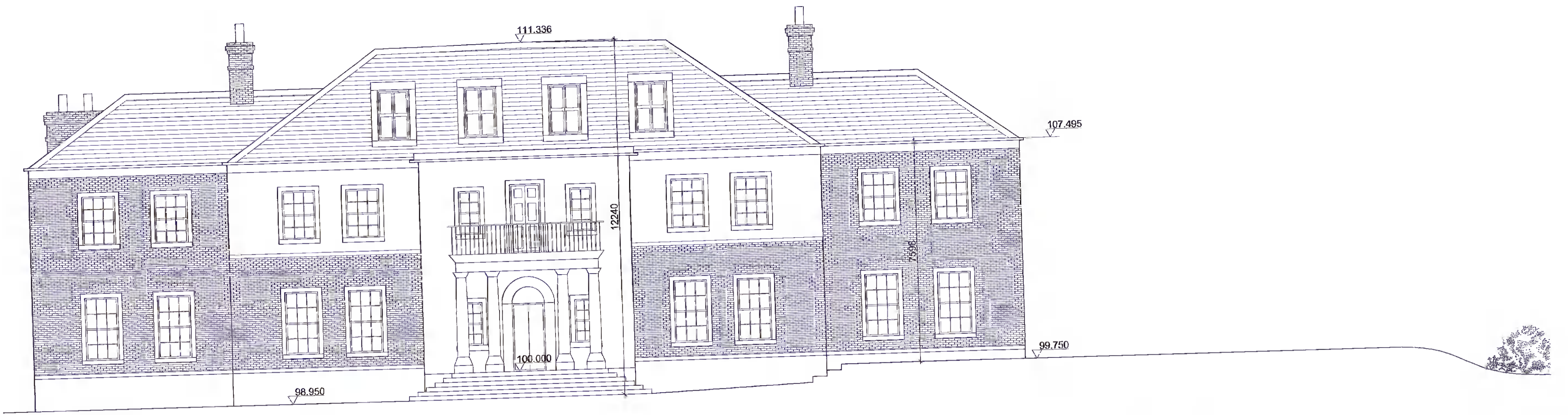
Existing Front Elevation @1:100