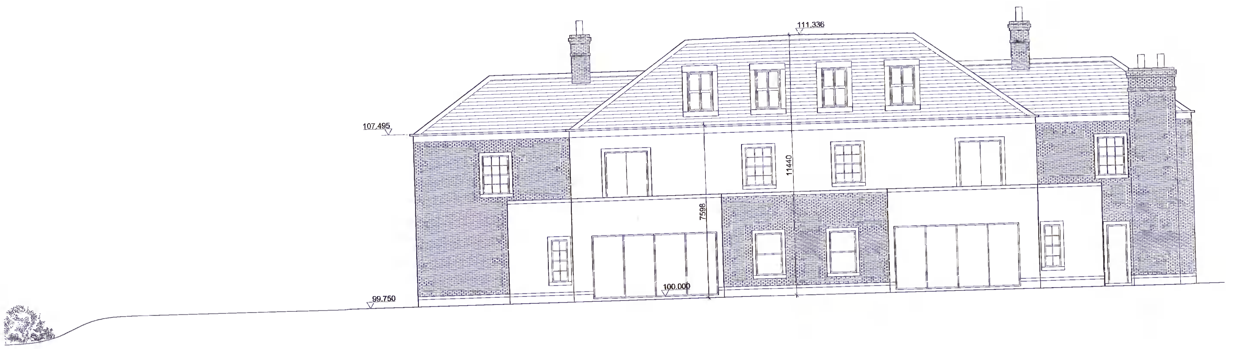
Existing Rear Elevation @1:100