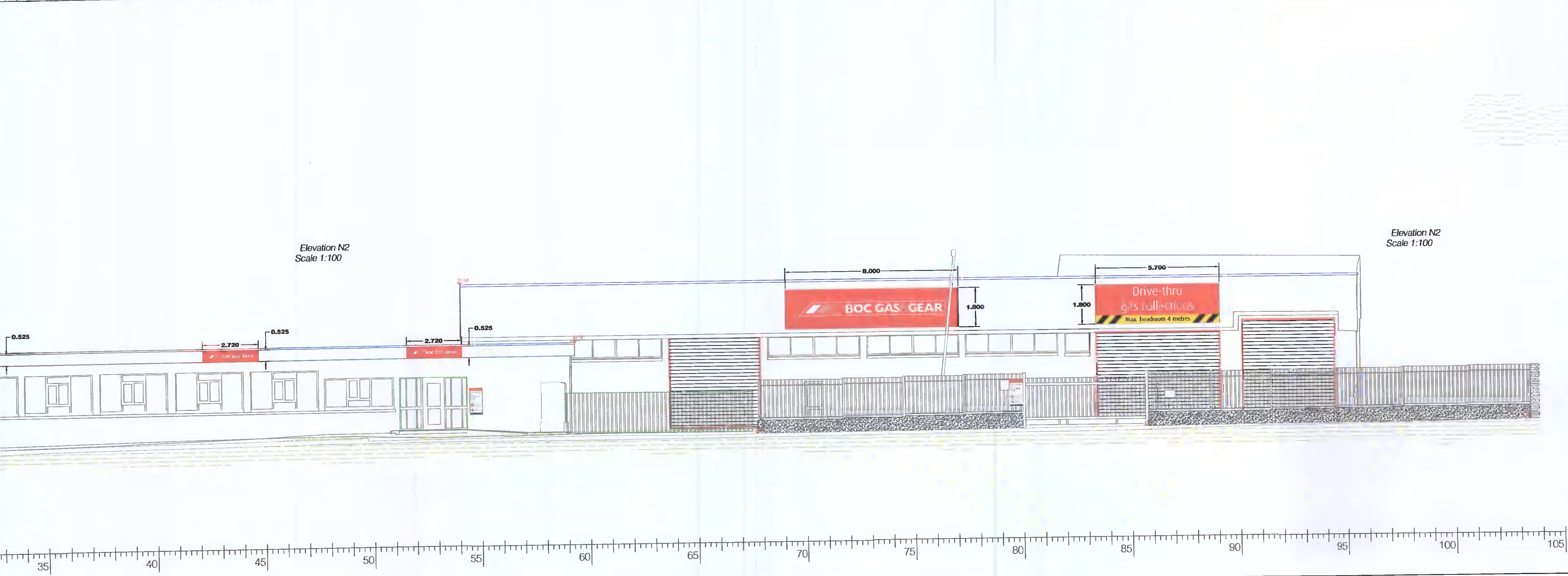
Elevation N2 Scale 1:100