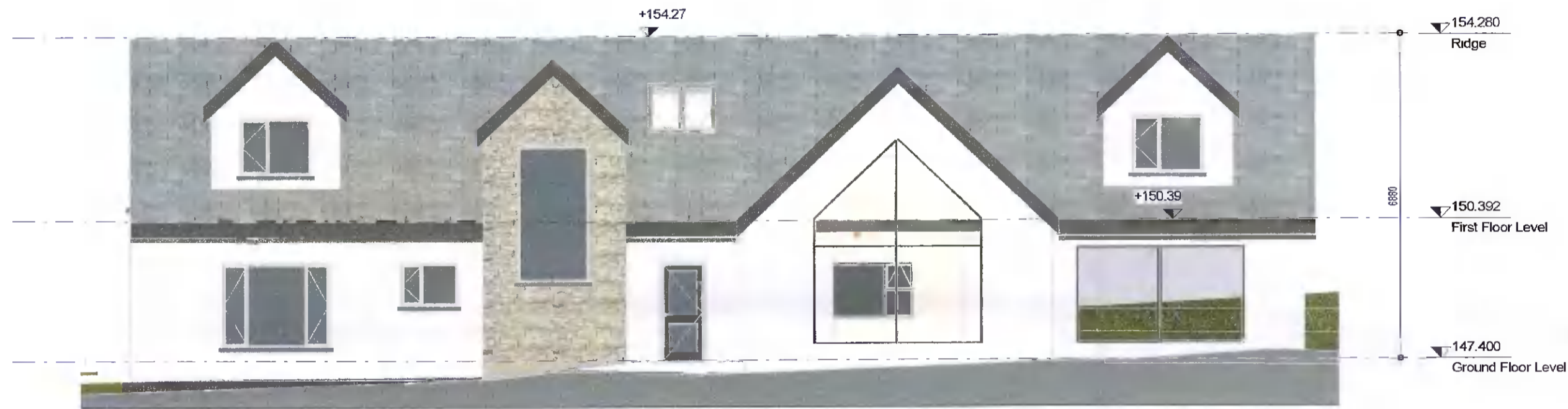
2 Existing/Demolition North West Elevation 1 : 100