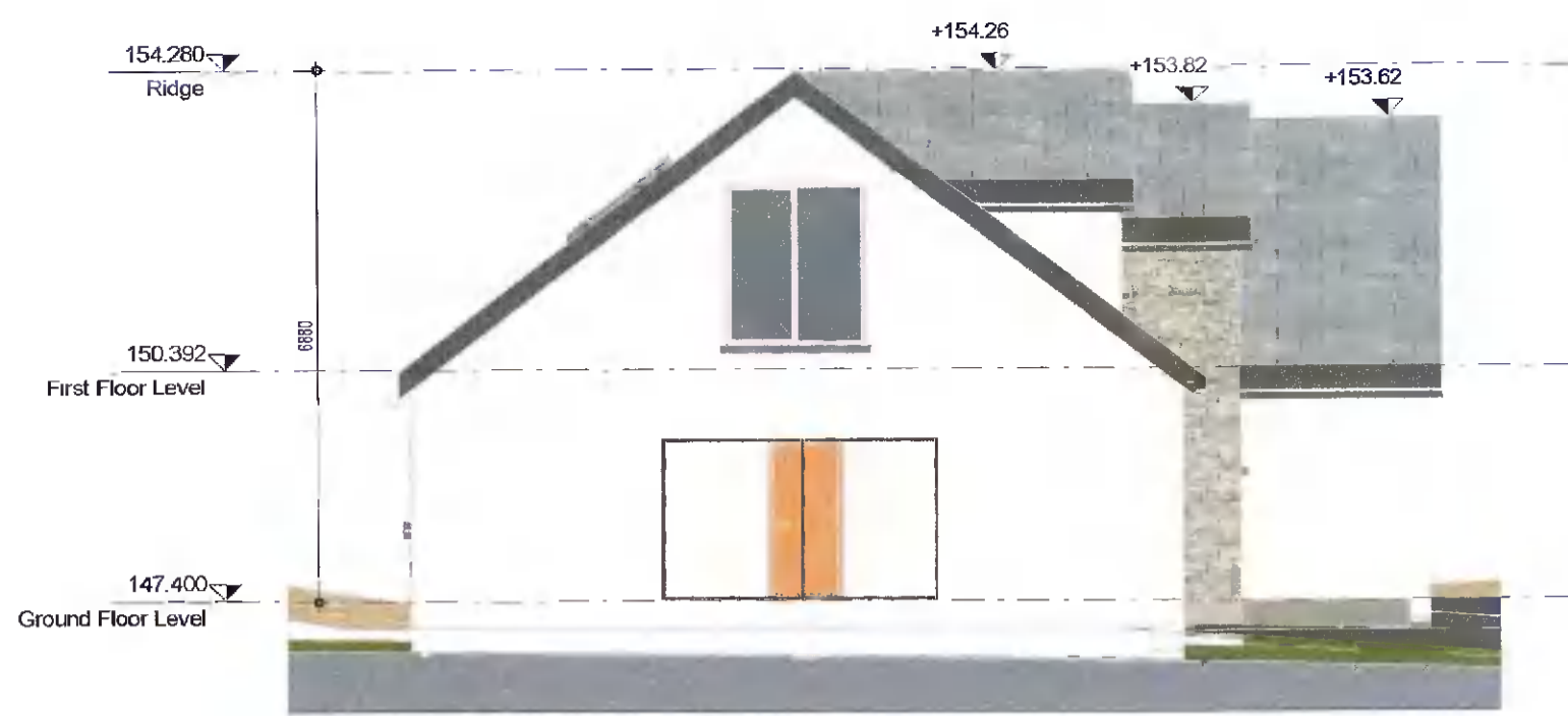
1 Existing/Demolition North East Elevation 1 : 100