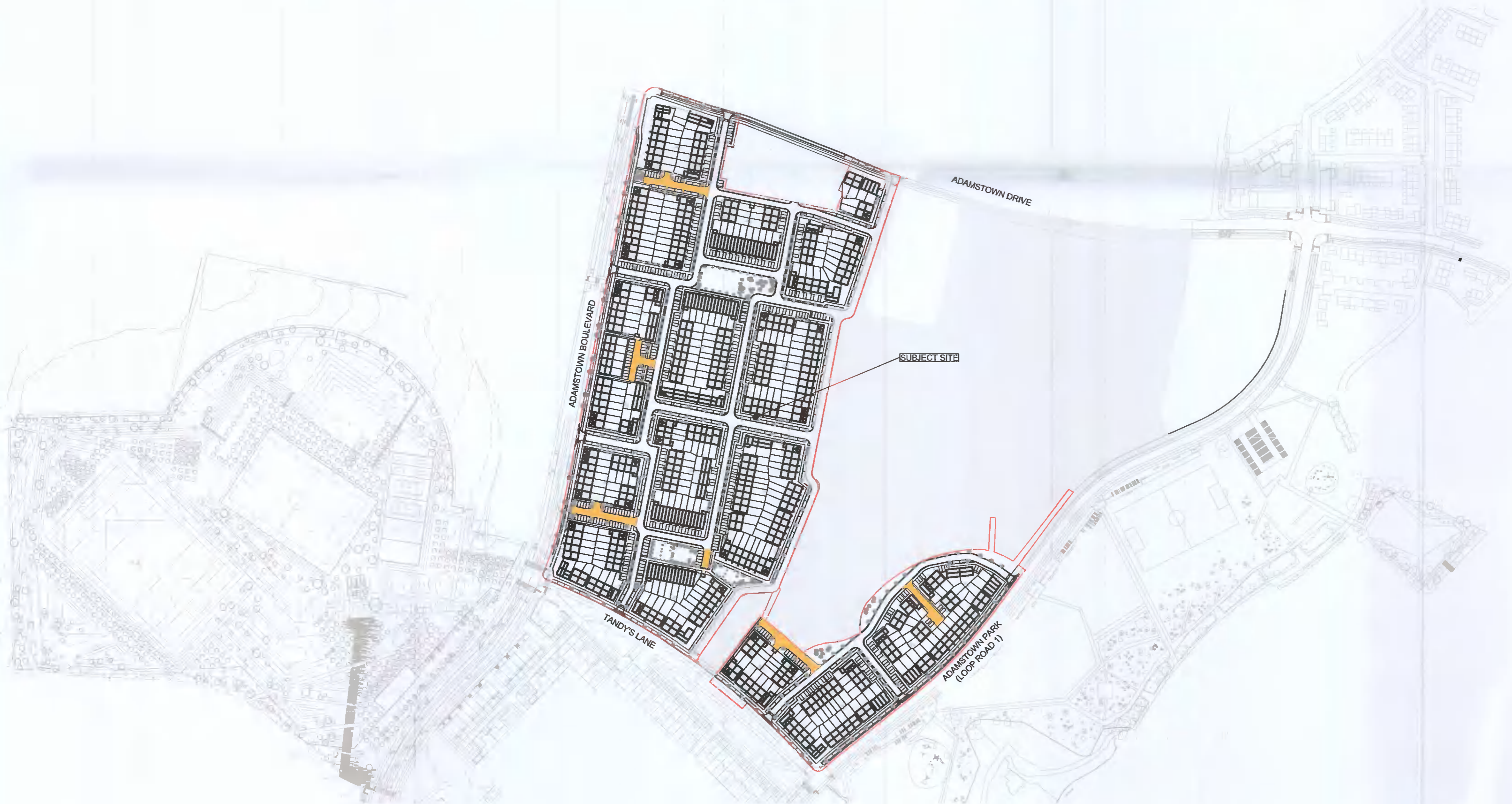
SITE LOCATION PLAN SCALE: 1:2000