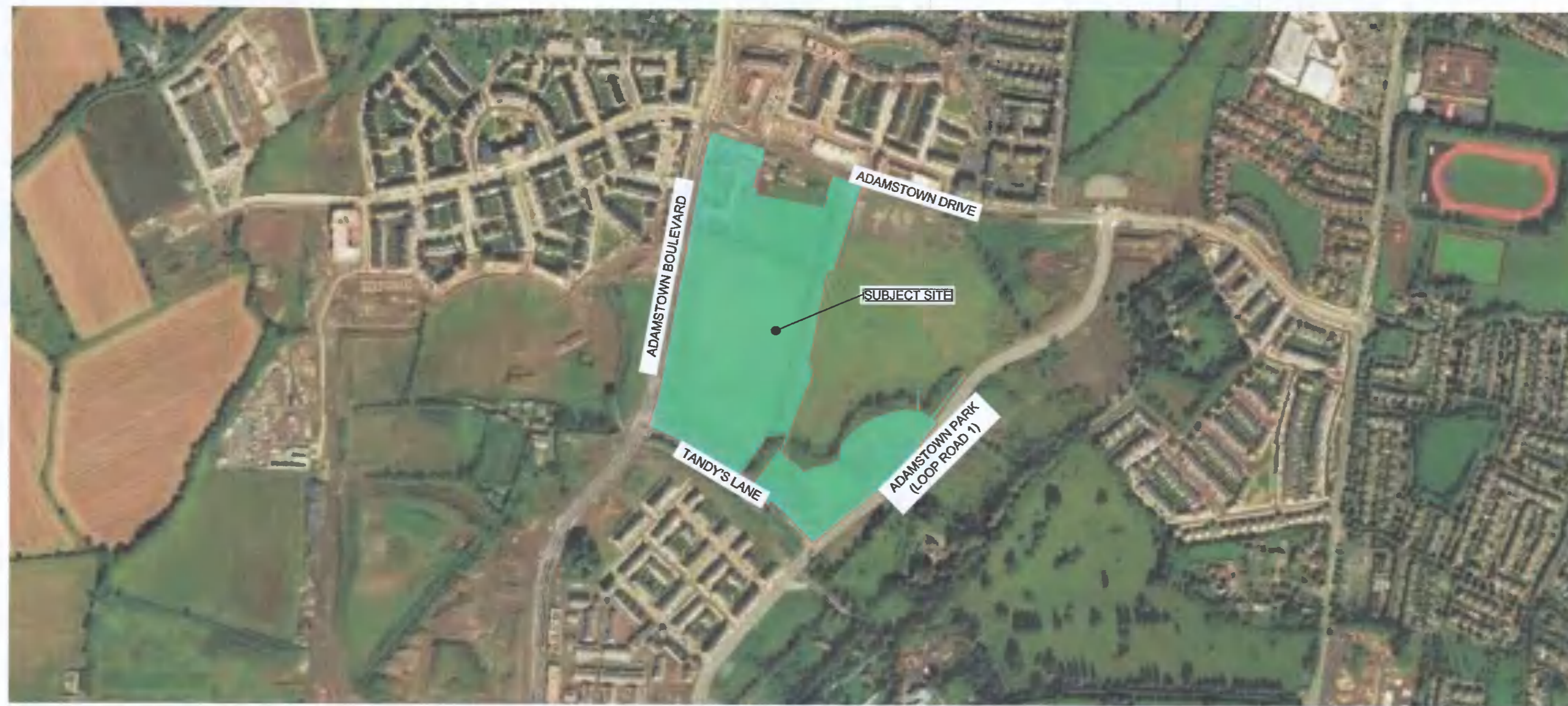
SITE LOCATION MAP N.T.S