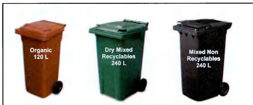
Figure 5.1 Typical waste receptacles of varying size (120 L and 240 L)

The types of bins used will vary in size, design and colour dependent on the appointed waste contractor. However, examples of typical receptacles to be provided in the WSAs are shown in Figure 5.1. All waste receptacles used will comply with SIST EN 840-1:2020 and SIST EN 840-2:2020 standards for performance requirements of mobile waste containers, where appropriate.