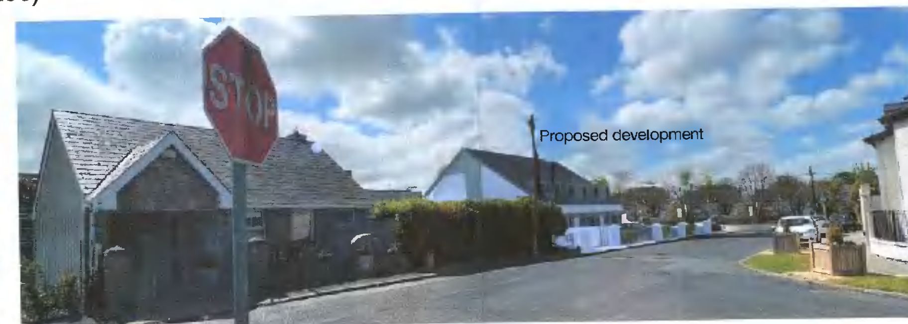
VIEW LOOKING WEST DOWN ST PATRICKS COTTAGES