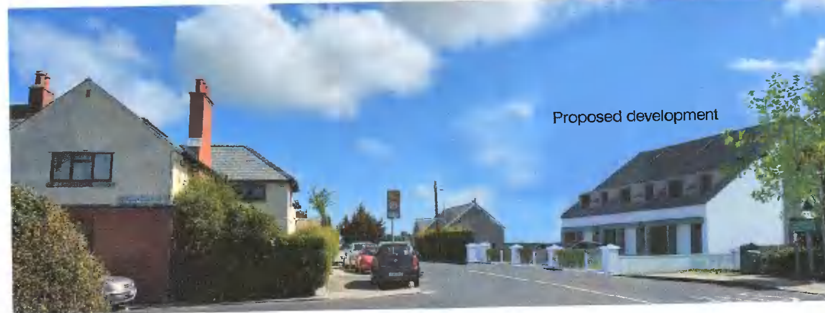
VIEW FROM WHITECHURCH ROAD LOOKING UP ST PATRICKS COTTAGES