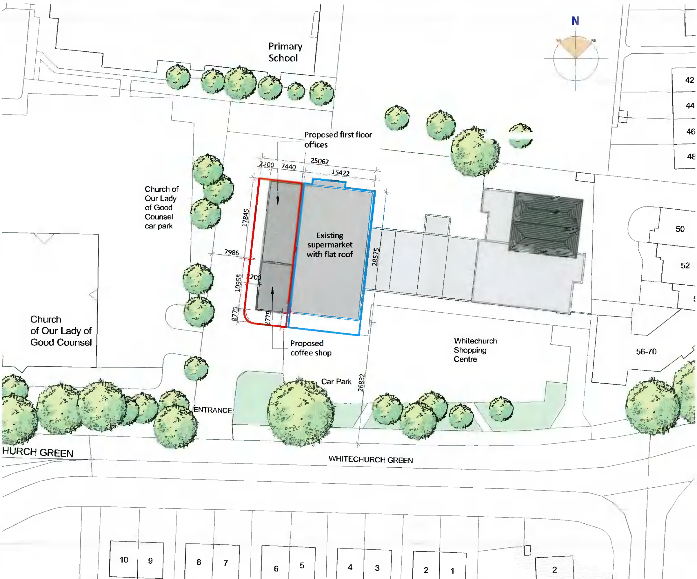
Proposed Site Layout Plan 1:500

NOTE: Do not scale from this drawing, written dimensions only to be used. This drawing is for planning purposes only & not for construction. Levels shown are for information purposes only & may not relate to O.S. Mean Sea Datum. For actual O.S. Mean Sea Datum always refer to the Site Layout Plan. DDA Architects Ltd retain copyright and ownership of this design which is not transferable.