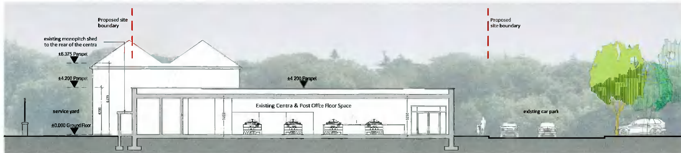
Existing Section B-B 1:200