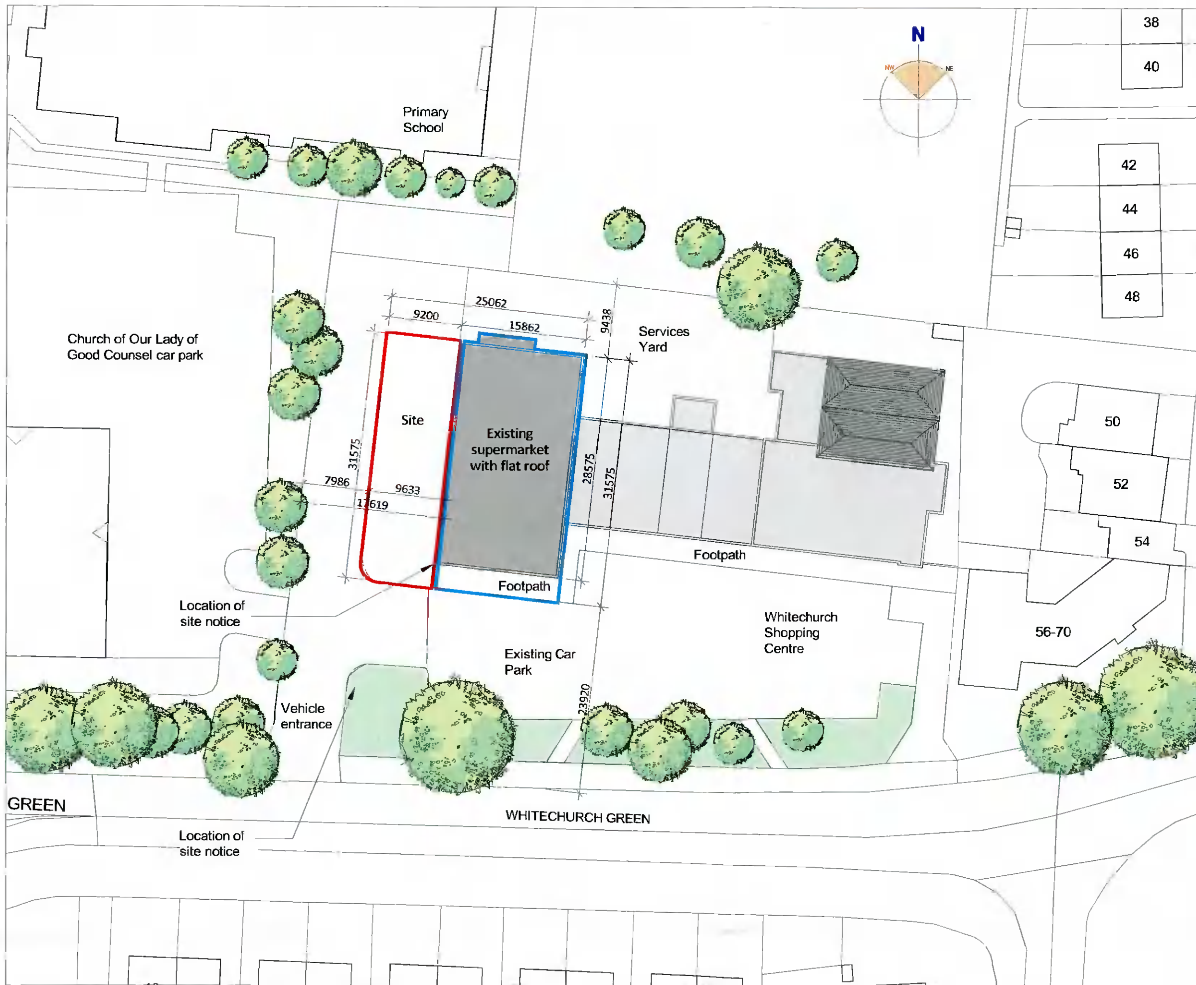
Existing Site Layout Plan 1:500

DDA ARCHITECTS LTD. OS LICENCE AR 0029322