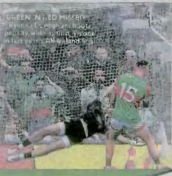
GREEN 'N' RED MISSED

But without those breaks, they would have been nowhere near winning Sam Maguire.