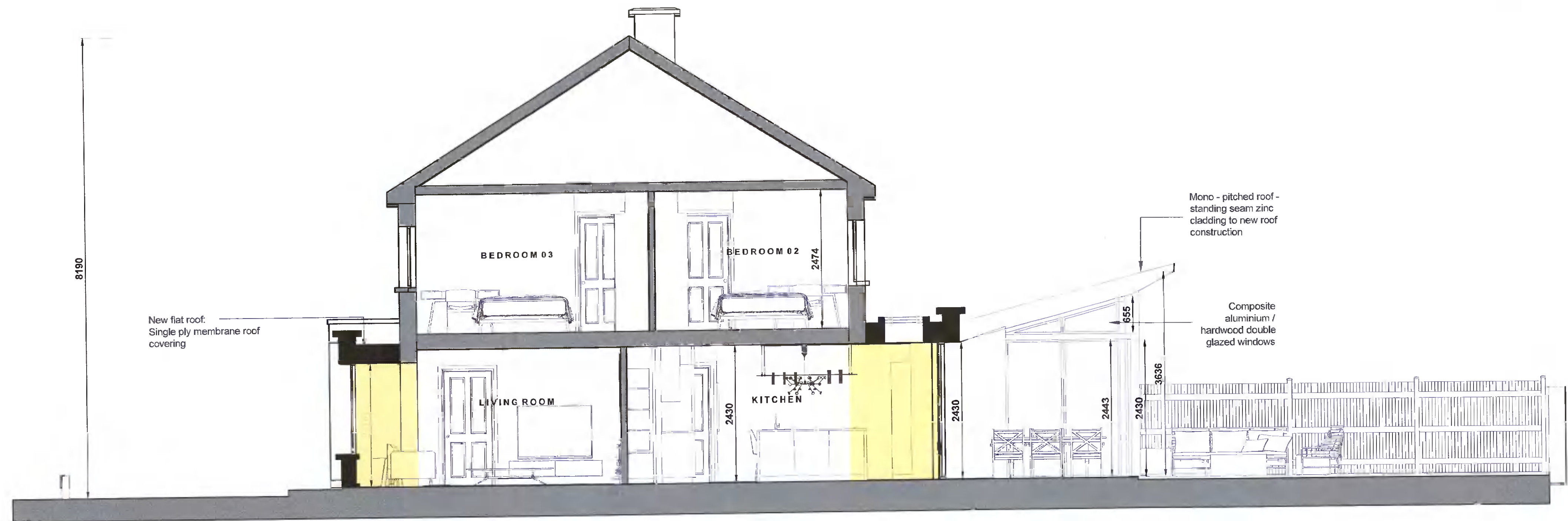
Proposed Section A-A Scale 1:50 @ A1

NOTE: 1. All dimensions to be checked on site. 2. The consent to be used in conjunction with relevant construction drawings.